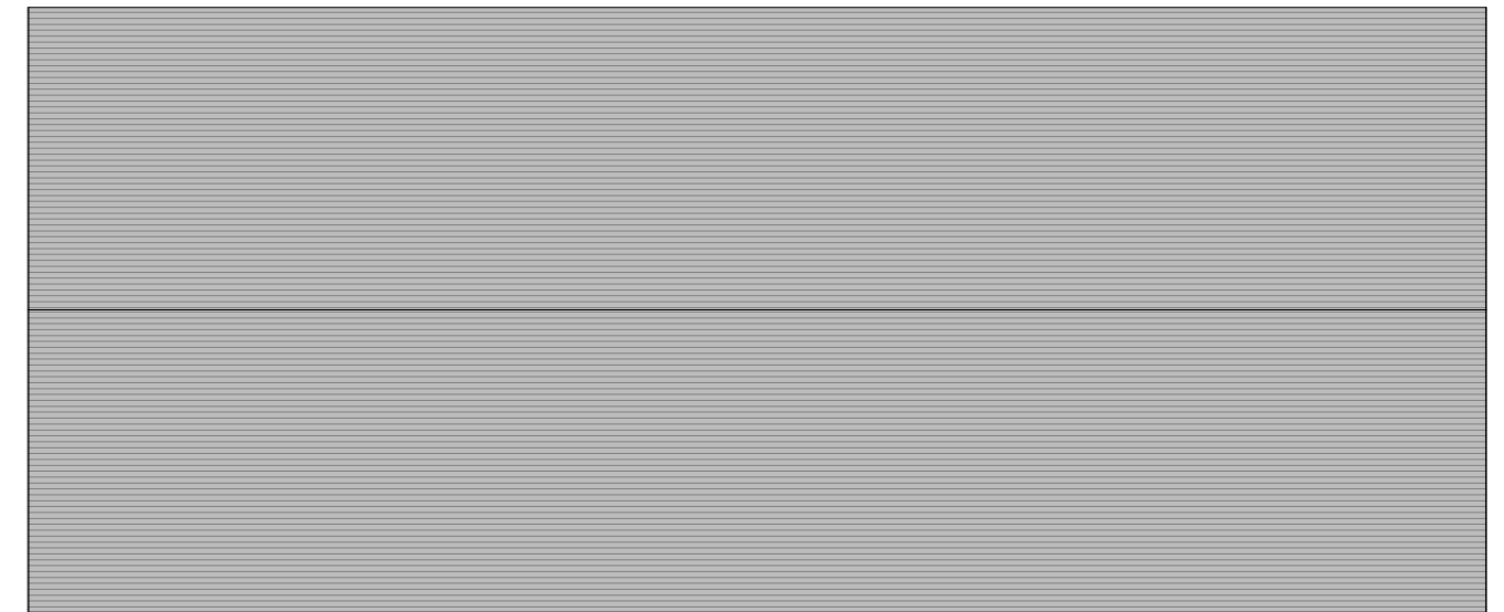
Roof Plan 1 : 100