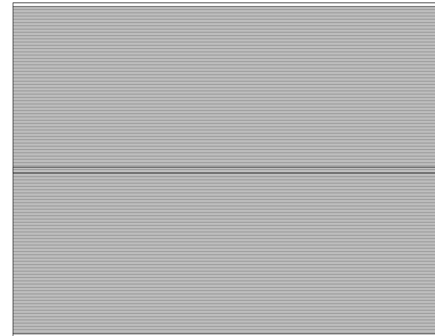
Roof plan 1 : 100