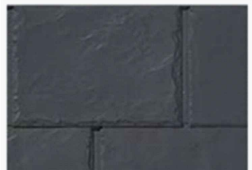
M7 - Roof slates