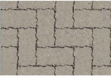
M16 - Permeable block paving to parking bays and driveways