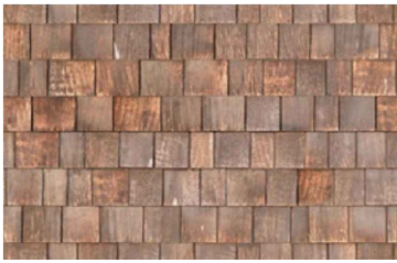
M2 - Timber shingles, drawing upon the materials palette of The Avenue