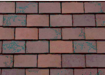
M6 - Roof tiles brown multi