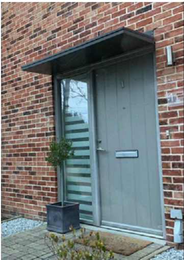
M10 – Doors and door canopies