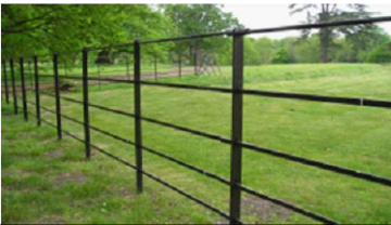
M19 - Estate railings around the cricket pitch