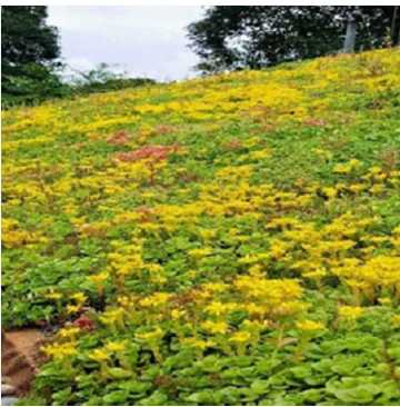
M8 - Green roof to the clubhouse