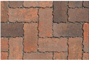
M14 - Permeable block paving to shared surfaces