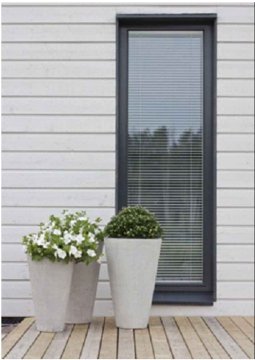
M11 - Grey colour coated windows