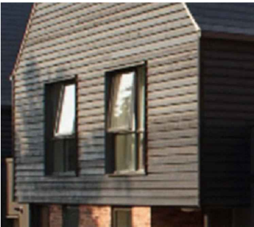
M3 - Weatherboarding, relating to The Avenue development