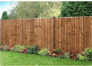
M18 - Timber fencing to the shared rear garden boundaries