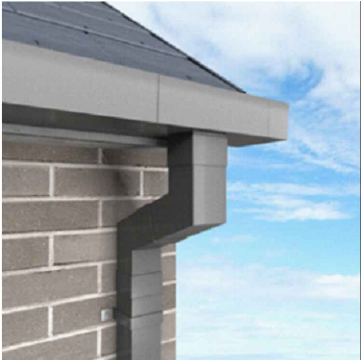
M12 - Black rainwater goods