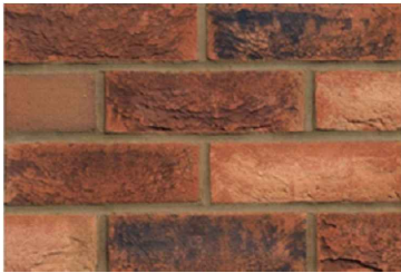
M1 - Brickwork, to relate positively to The Avenue development