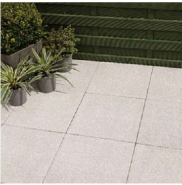
M17 - Concrete paving to private pathways and patio areas