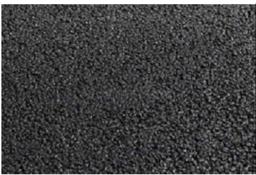
M13 – Permeable blacktop to principal roads