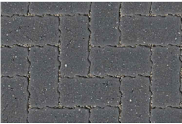
M15 - Permeable block paving to delineate parking bays