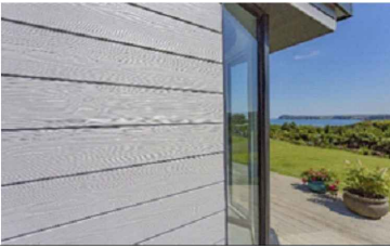
M4 - Cladding to feature elements