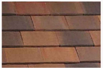
M5 - Roof tiles red multi