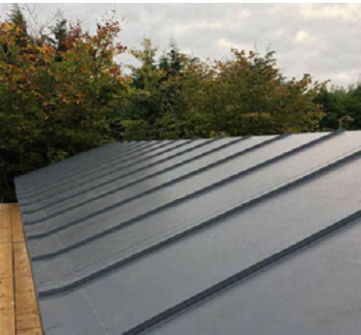
M9 – Sheet roofing to the clubhouse and flat roofed garages