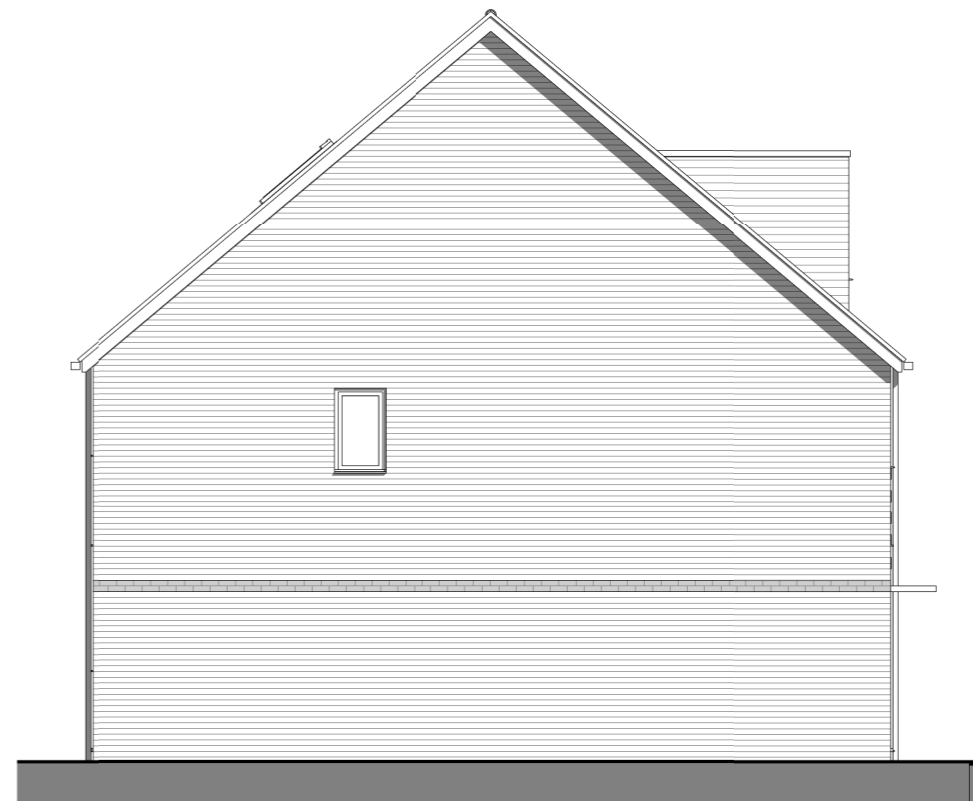
Side Elevation 1 : 100