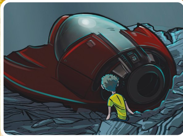
In the Cave