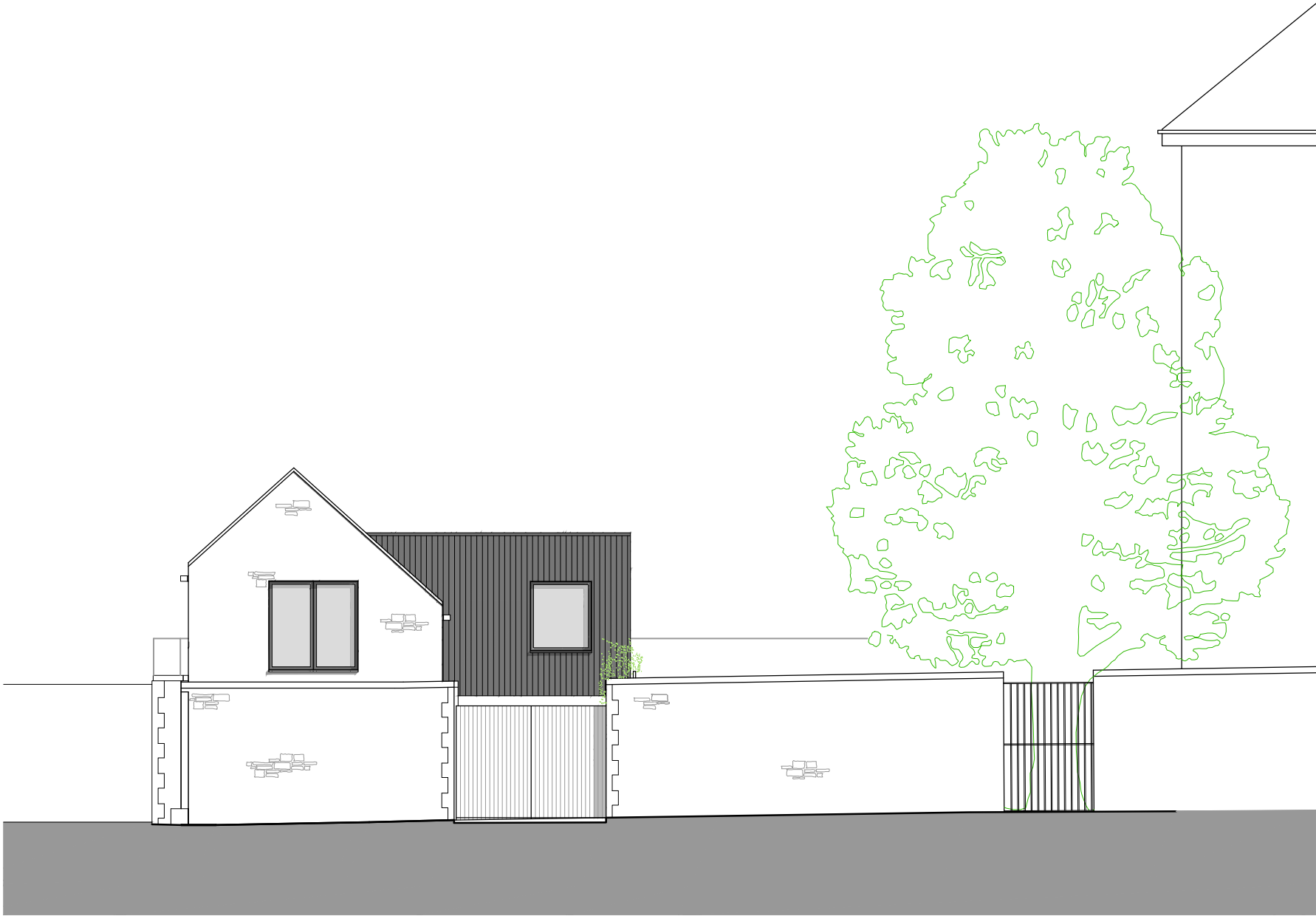
PROPOSED WEST (STREET) ELEVATION

Responsibility is not accepted for errors made by others scaling from this drawing. All construction information should be taken from figured dimensions only.