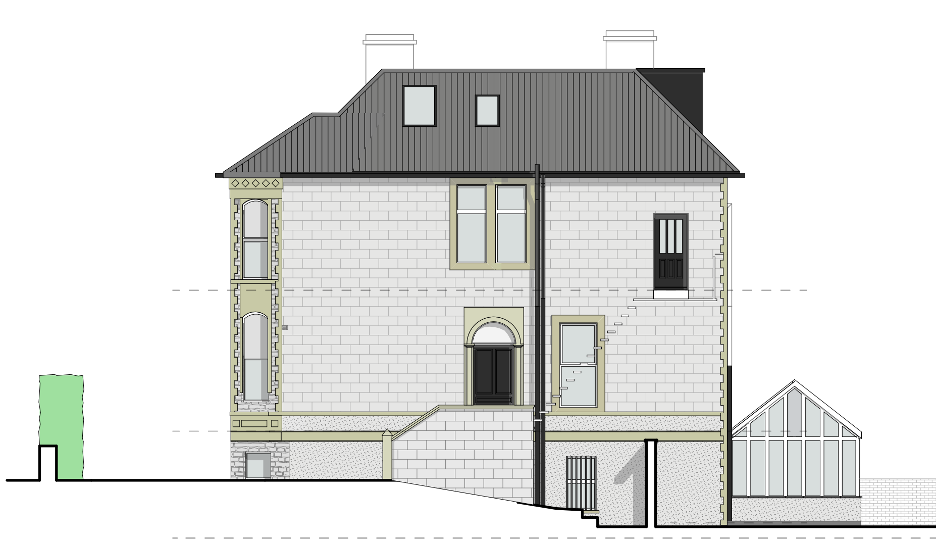
Existing Side A/South-East Elevation