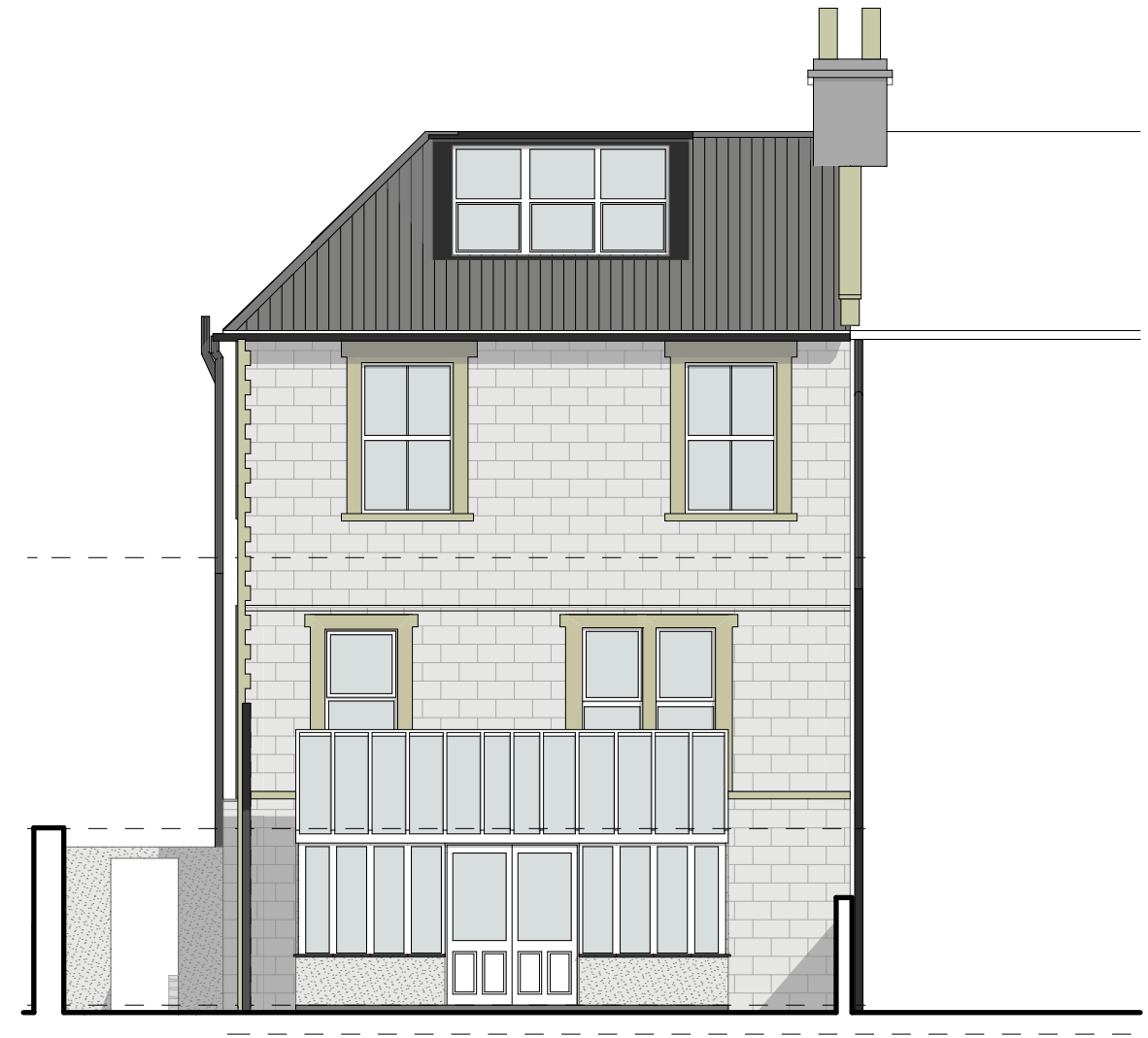
Existing Rear/North-East Elevation