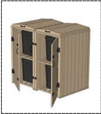
Covered recycle box store 2 proposed