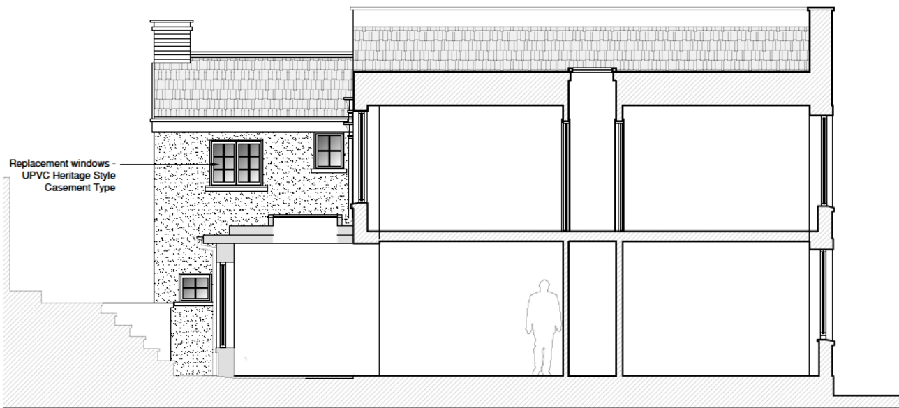
EX & PR SIDE (EAST) SECTIONAL ELEVATION

PROPOSED MATERIALS MAIN ROOF- Concrete/Clay interlocking tiles 'DOUBLE ROMAN' Colour Brindle. UPVC / Painted SW Fascias and Soffits FLAT ROOF - Single Ply Membrane/GRP colour Grey WALLS - Front Elevation - Random Stonework with painted stucco banding. Rear & Side Elevations Inc Proposed Extension- Painted Render Colour White WINDOWS - Front Elevation Painted Timber Sash Window Rear Elevations - UPVC Heritage Range Colour White DOORS - Painted/Composite Timber RAINWATER GOODS - Upvc / Cast Iron