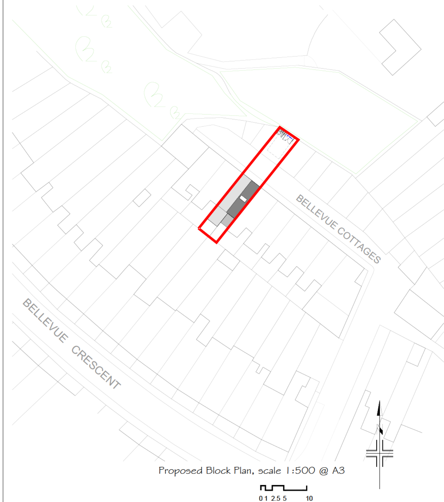
Proposed Block Plan, scale 1:500 @ A3