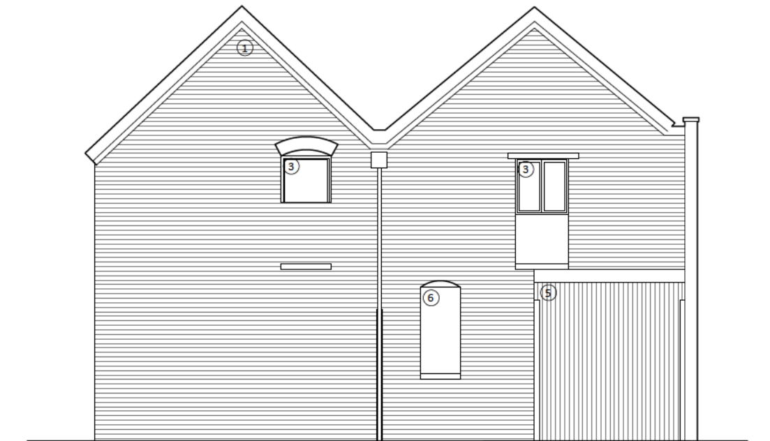
SOUTH WEST ELEVATION - FRONT