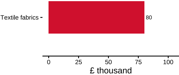
The top 1 UK goods imports, in the four quarters to the end of Q3 2024, from BIOT