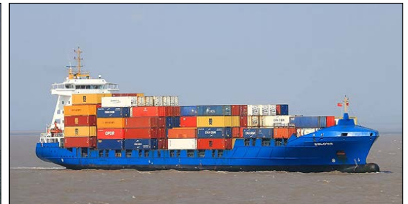
Figure 2: Solong