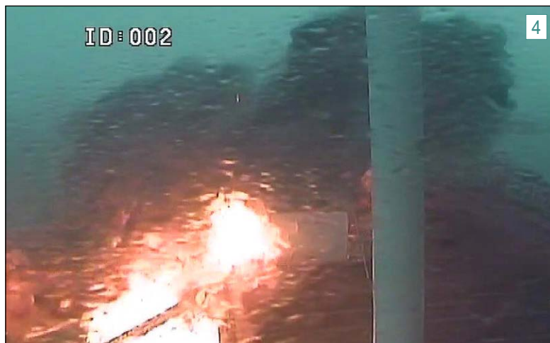
Figure 4: Initial collision