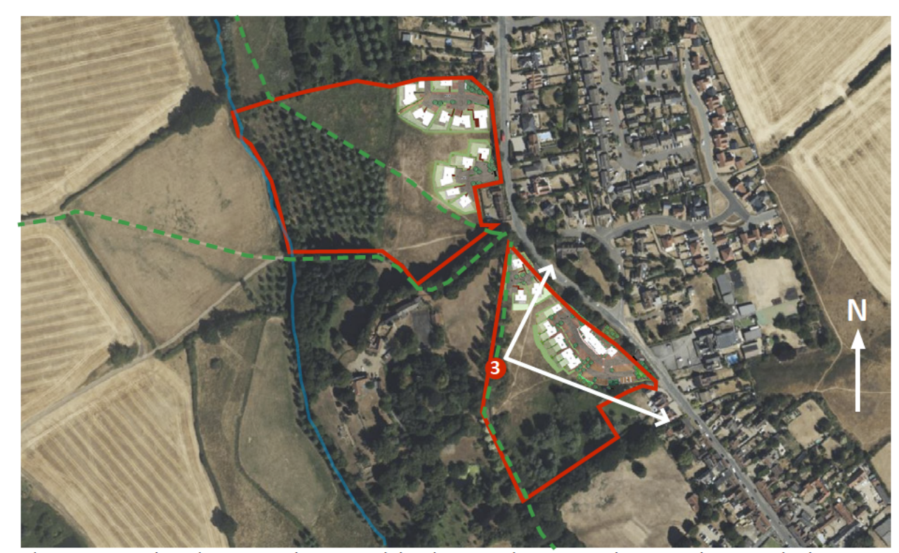
Above: View 3 photo location with proposed development, houses are shown in white, new hedgerow planting in light green.