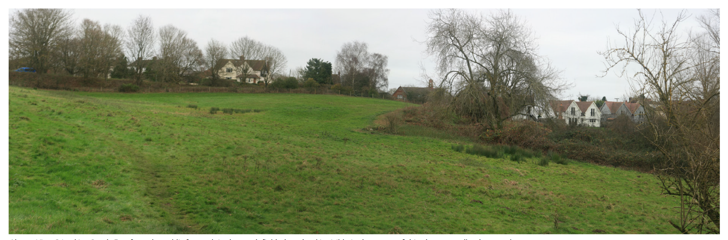
Above: View 3 Looking South-East from the public footpath in the south field, the school is visible in the centre of this photo as well as houses along The High Street.