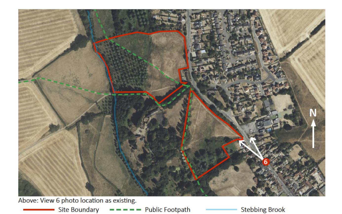
Above: View 6 photo location with proposed development, houses are shown in white, new hedgerow planting in light green.