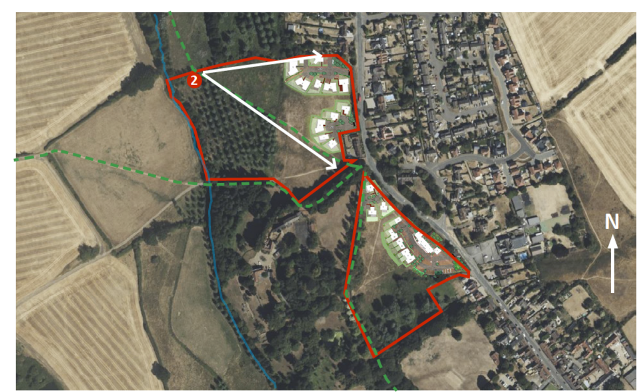
Above: View 2 photo location with proposed development, houses are shown in white, new hedgerow planting in light green.

Above: View 2 photo location as existing. Site Boundary — — — Public Footpath — Stebbing Brook