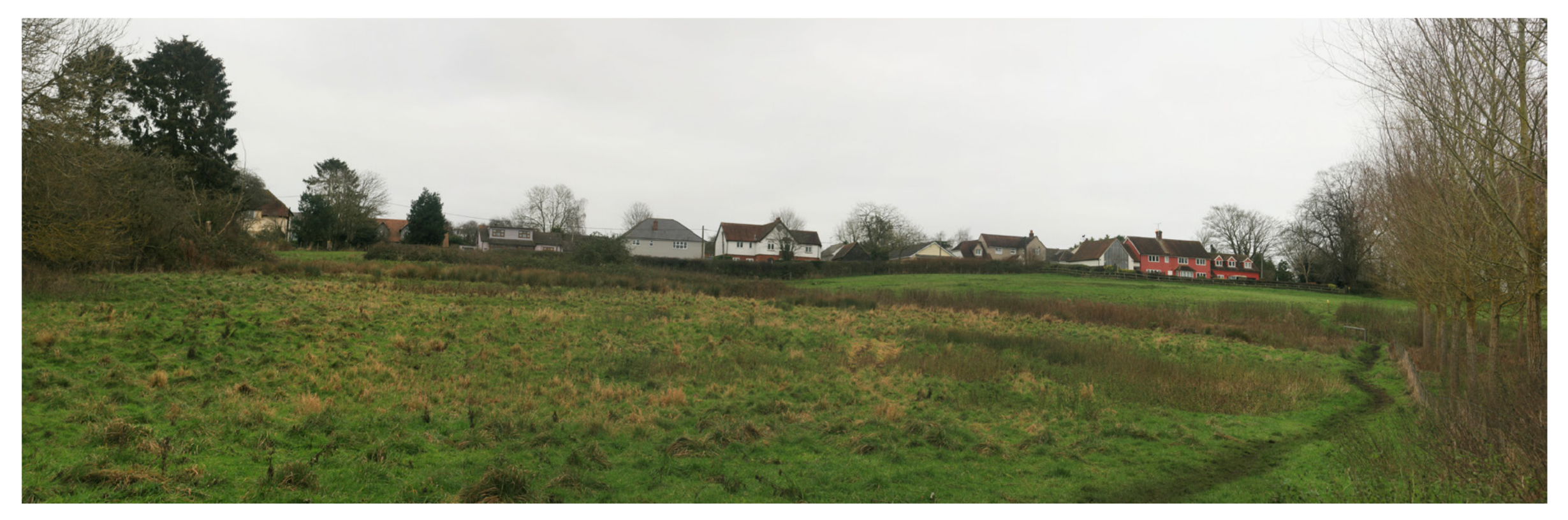
Above: View 2 Looking East from the public footpath in the north field, houses along The Downs road are visible from this position. The existing wet woodland is to the right of the image.