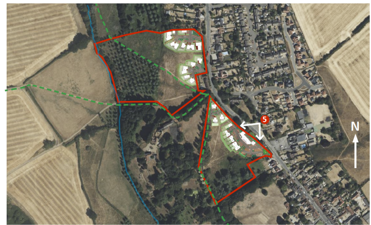
Above: View 5 photo location with proposed development, houses are shown in white, new hedgerow planting in light green.