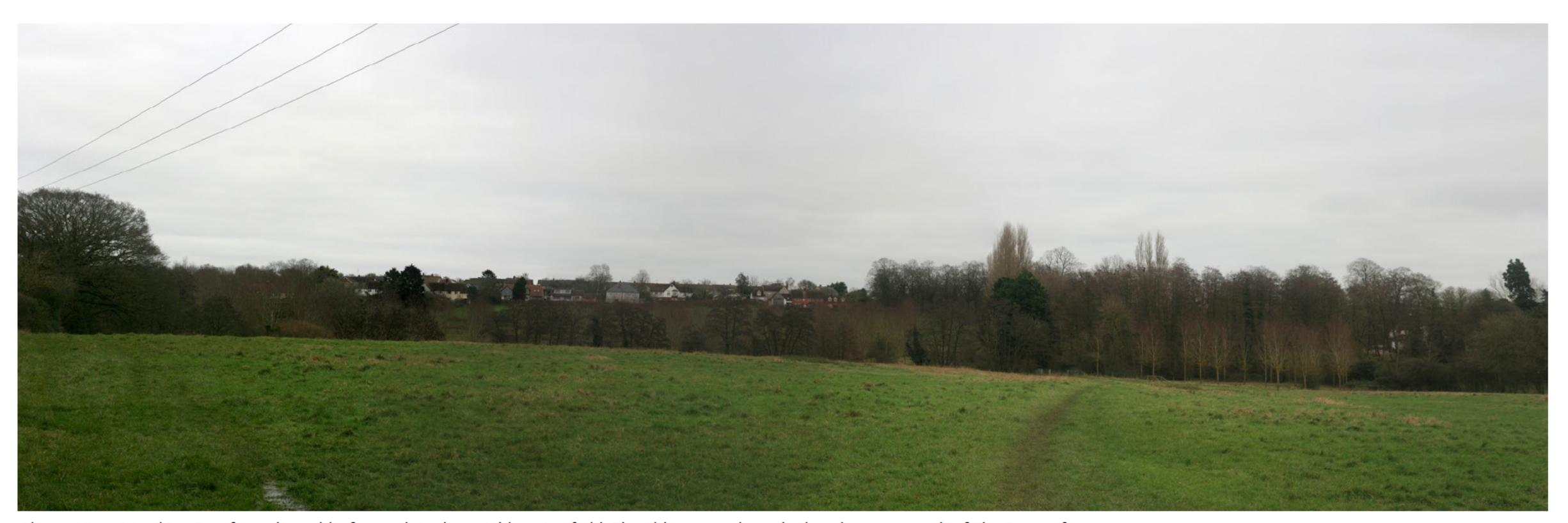
Above: View 1 Looking East from the public footpath in the neighbouring field. The alder trees along the brook screen much of The Downs from this position with the house on the ridge visible above the trees.