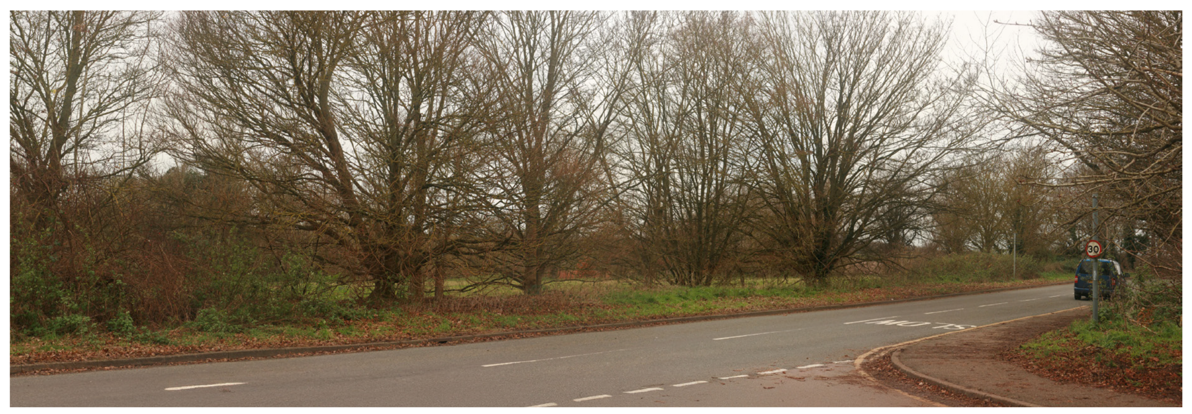
Above: View 5 Looking West from The Downs road and High Street junction towards the south field.