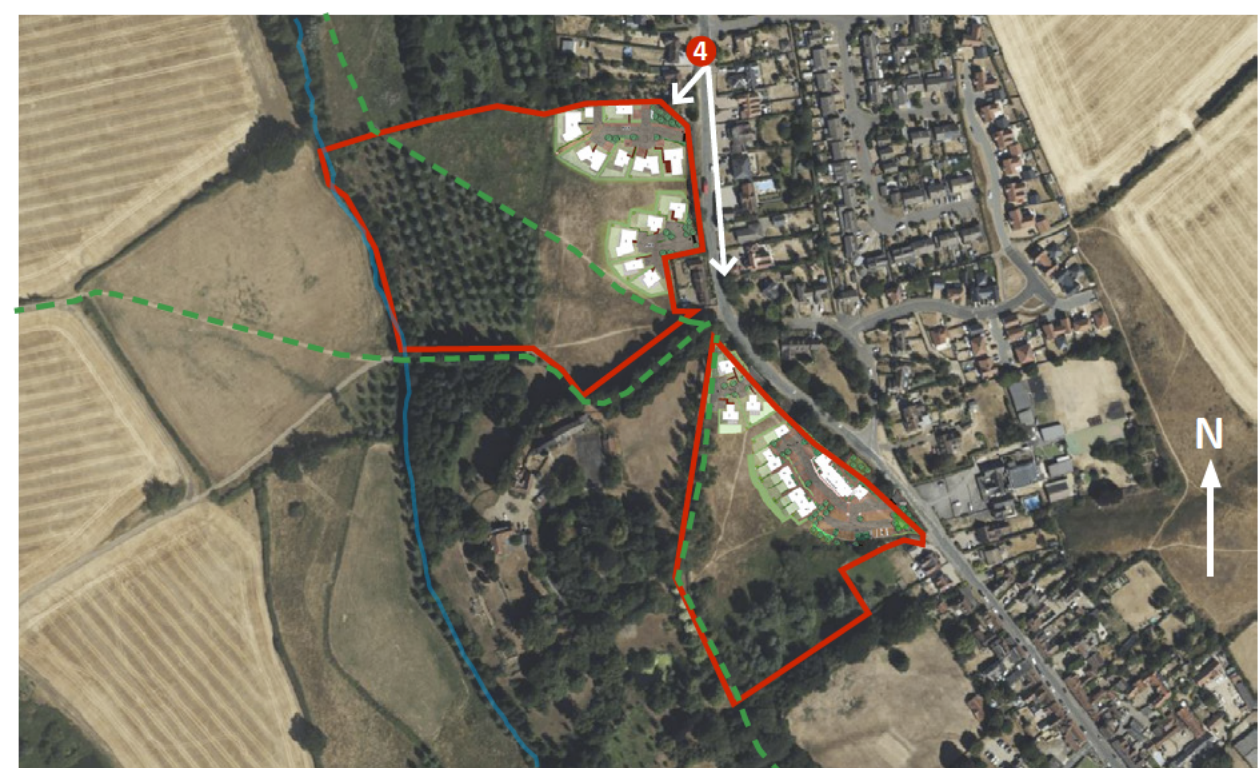
Above: View 4 photo location with proposed development, houses are shown in white, new hedgerow planting in light green.