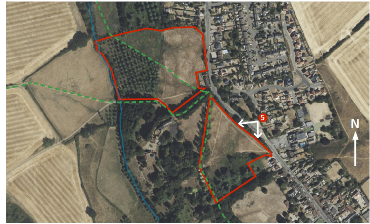
Above: View 5 photo location as existing. Site Boundary — — — Public Footpath — Stebbing Brook