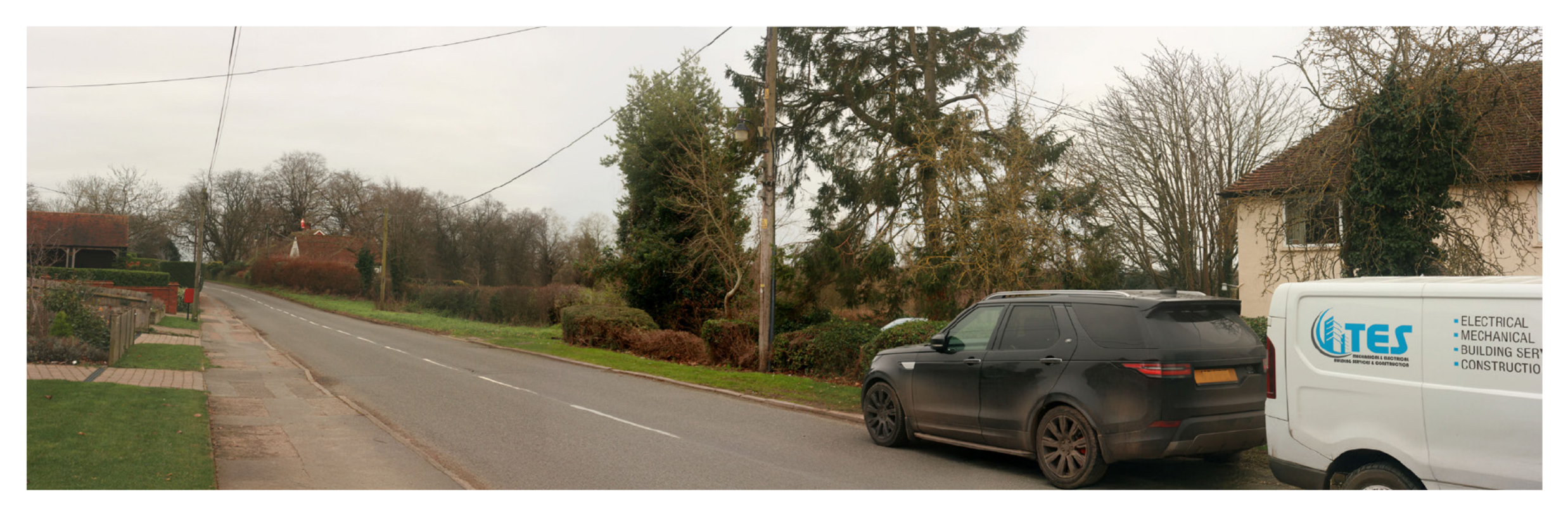
Above: View 4 Looking South from The Downs road towards The Falcons in the centre of the image.