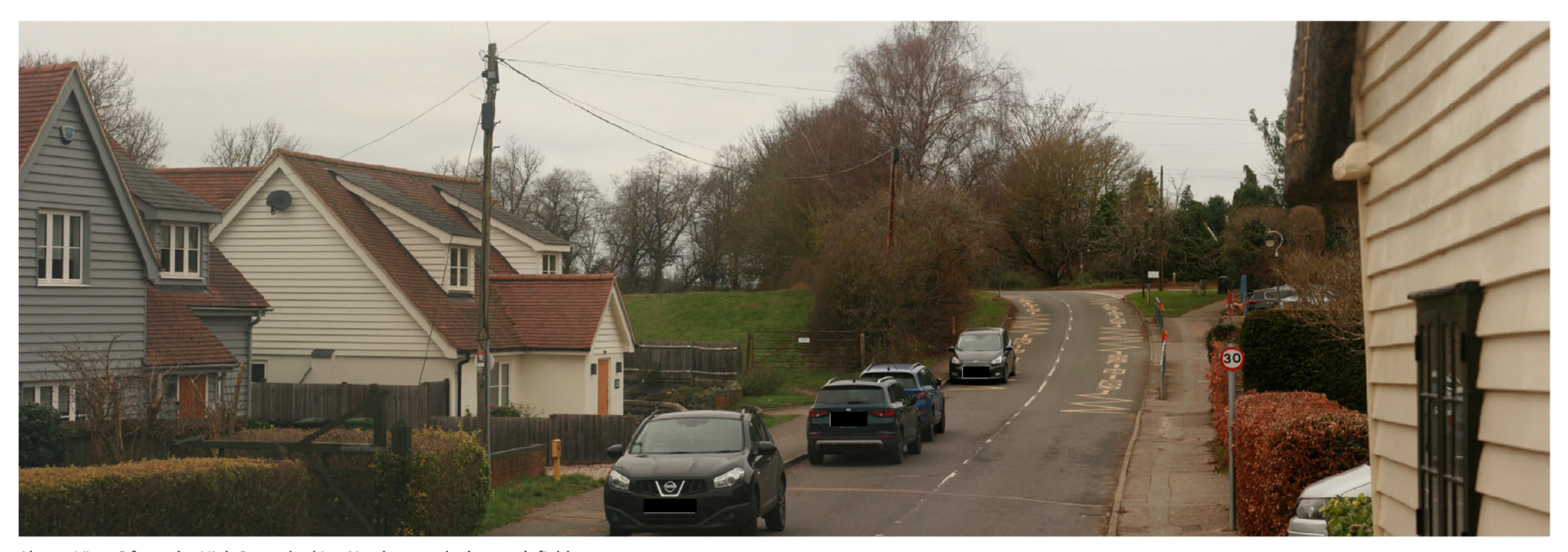
Above: View 6 from the High Street looking North towards the south field.