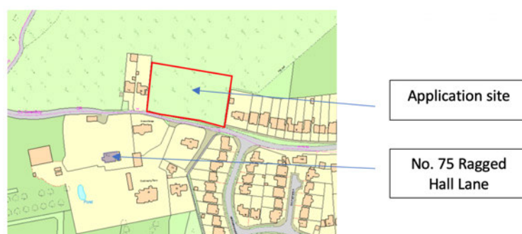
Figure 2.1. The position of No. 75 Ragged Hall Lane relative to the application site

The only listed building within reasonable proximity of the application site is No. 75 Ragged Hall Lane, which is a Grade II Listed building, as marked on Figure 2.1.