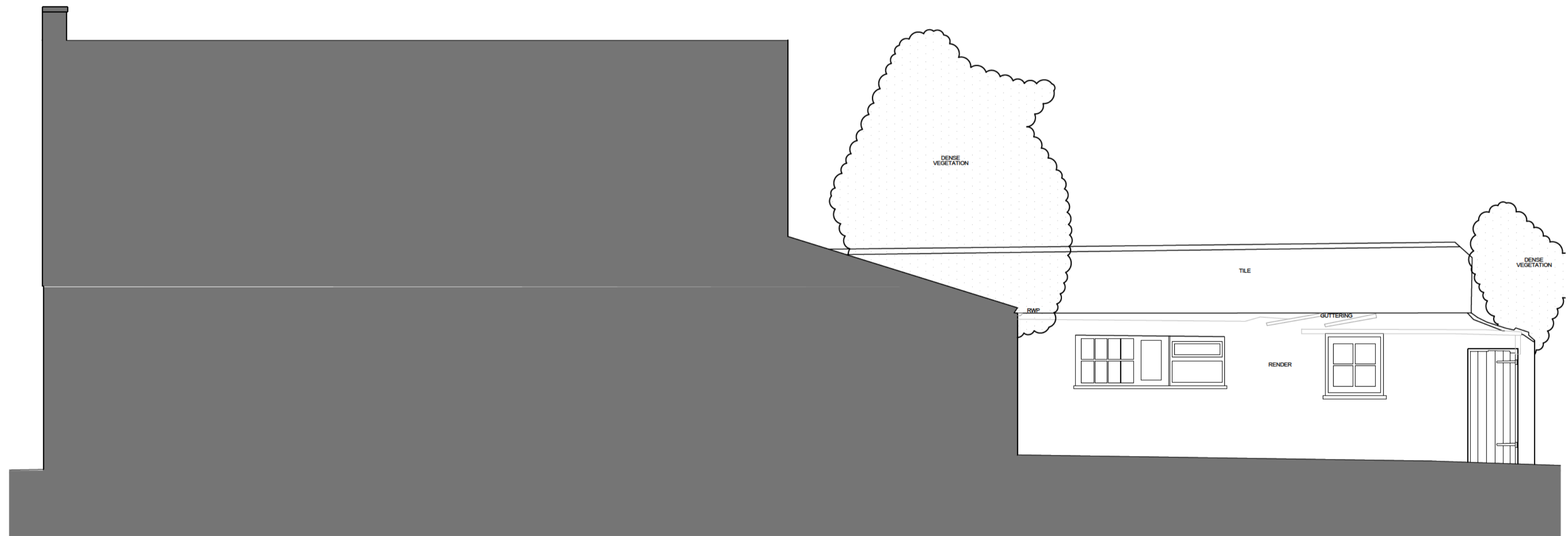
Side Elevation North East Facing