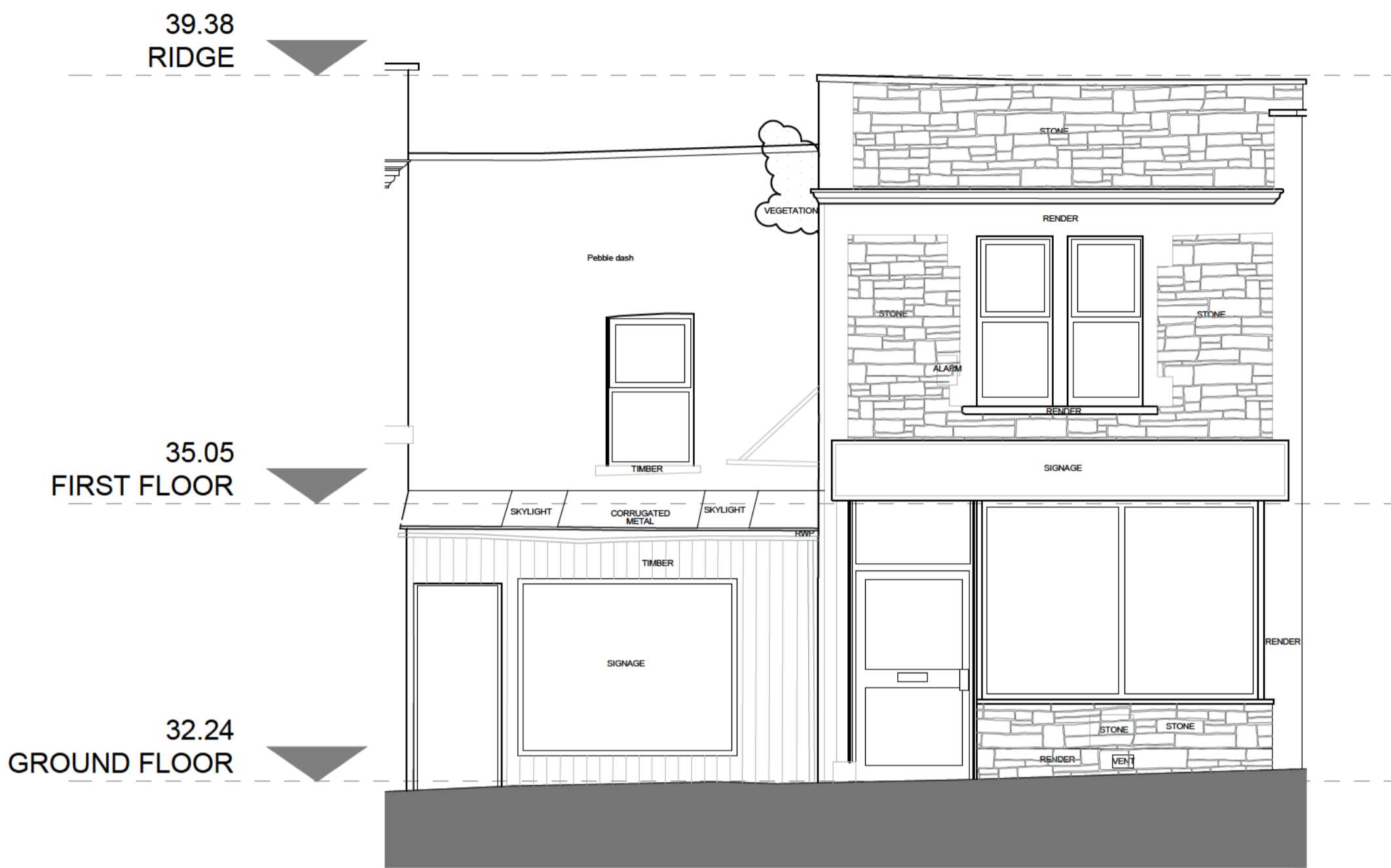
Front Elevation South East Facing