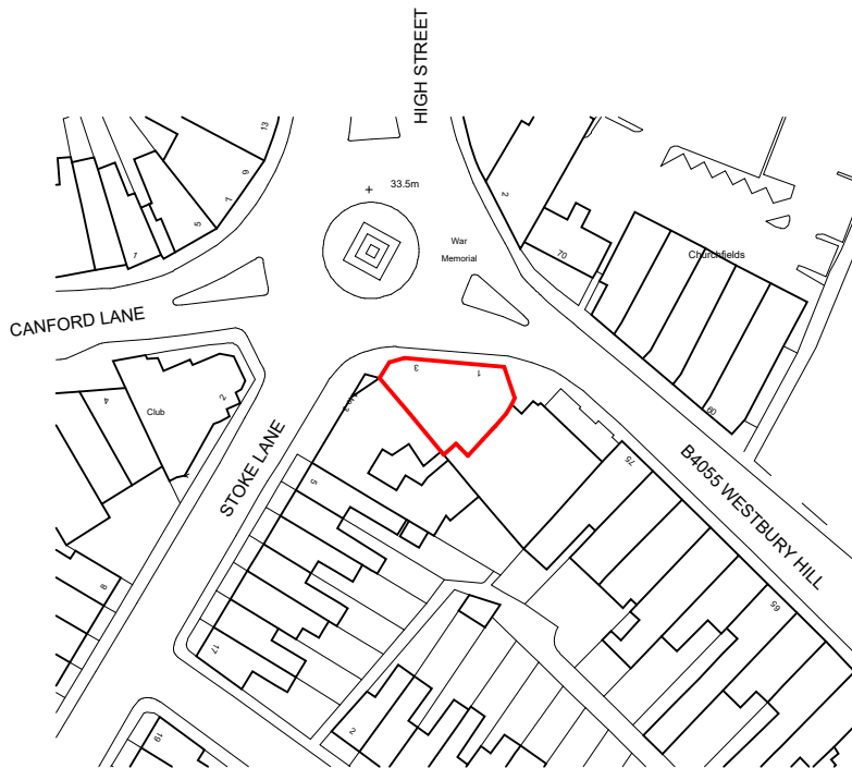
Mapping contents © Crown copyright and database rights 2024 Ordnance Survey 100035207