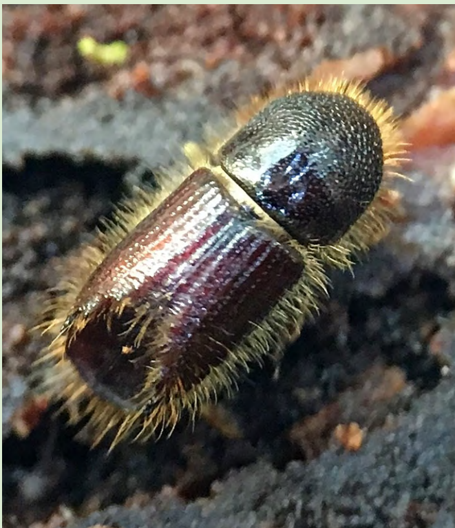
Ips typographus beetles bore into bark where they attract mates and lay eggs. Adult Ips typographus beetles are approximately 5mm long.