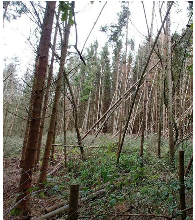
Stressed Norway spruce trees which creates ideal conditions for Ips typographus infestation.

The eight-toothed spruce bark beetle ( Ips typographus ) can often be confused with the great spruce bark beetle ( Dendroctonus micans ). A symptom guide is available on the Forest Research webpage 1 to assist with identification.