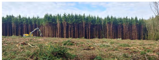
Proactive felling of spruce in South East England.