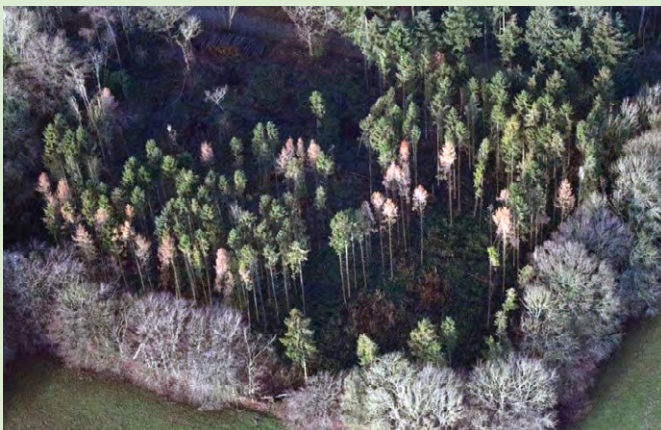
Aerial view of stressed trees from the original 2018 outbreak site in the UK.