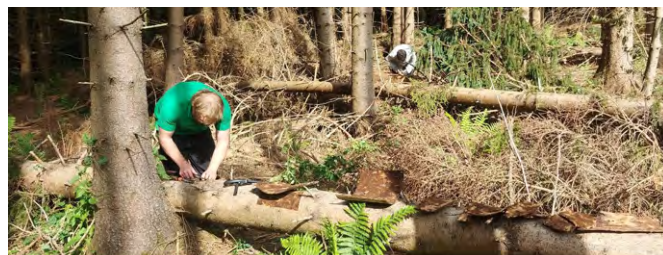
Forestry Commission and Forest Research staff at an outbreak site in South East England.