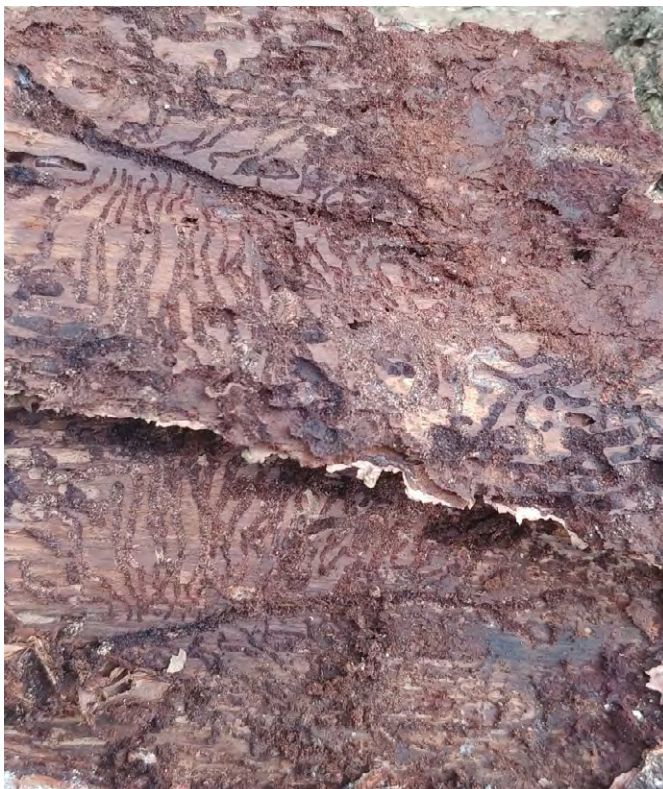
Larval gallery under the bark of spruce showing larval galleries radiating out from a straight, vertical maternal gallery.