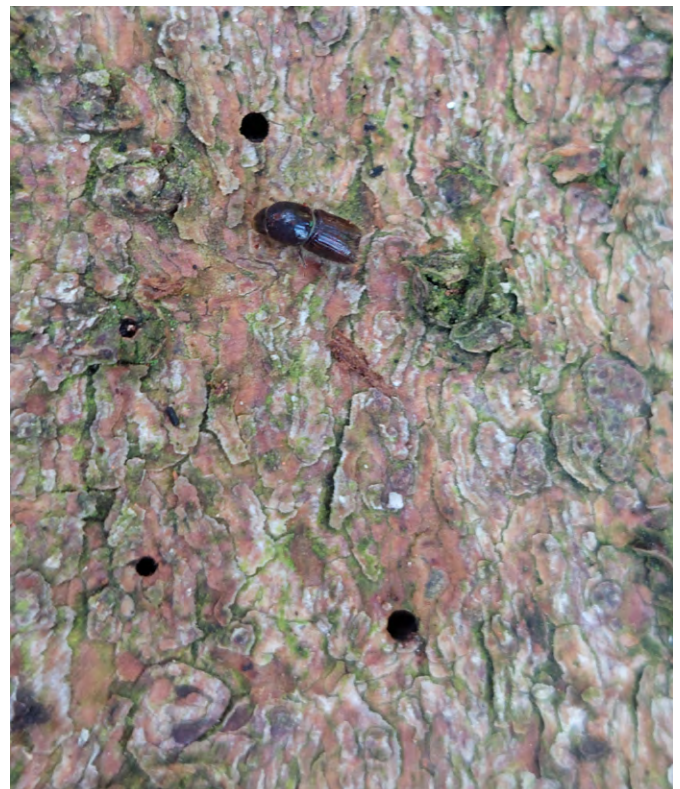
Exit holes (2.5-3 mm approximately), caused by eight-toothed spruce bark beetle ( Ips typographus ).