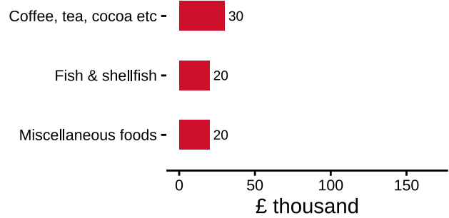
The top 3 UK goods imports, in the four quarters to the end of Q3 2024, from Micronesia