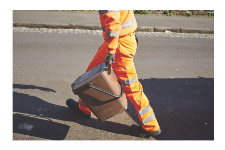
Table 1 Types of waste and recycling container

Table 1 details the size and volume of the waste and recycling containers issued to houses and buildings with up to six flats.