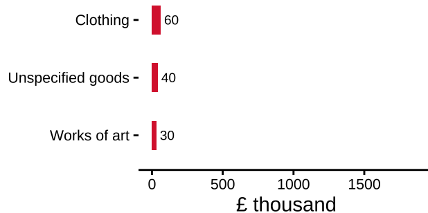
The top 3 UK goods imports, in the four quarters to the end of Q3 2024, from Bhutan