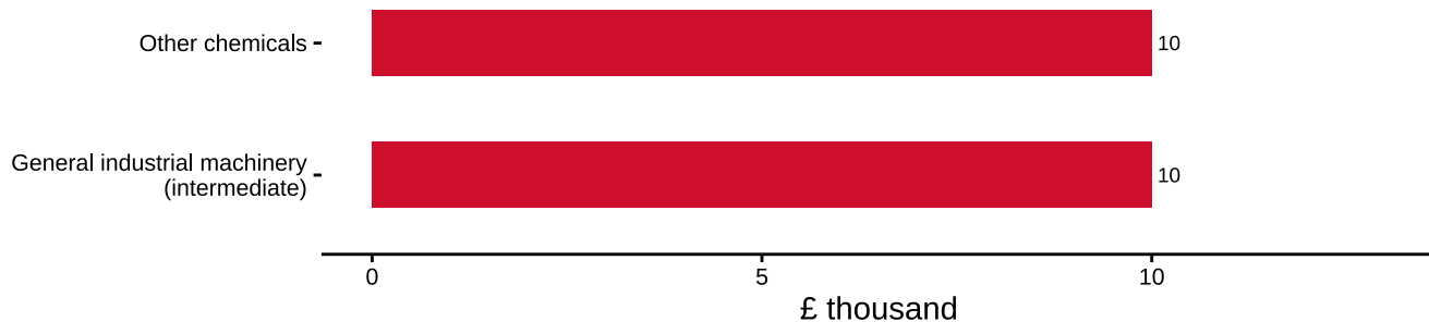
The top 2 UK goods exports, in the four quarters to the end of Q3 2024, to American Samoa

The chart below shows the top 2 products exported from the UK to American Samoa, by value, in the four quarters to the end of Q3 2024. All data shown in the chart are provided in the text above.