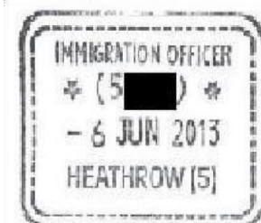
Immigration Officer's Date Stamp