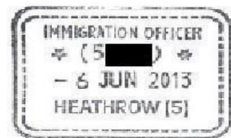
Immigration Officer's Date Stamp

In a small number of cases, when the Schemes went live, a Code 1A was not available, in place of this a Code 1 was used with the "no recourse to public funds" scored out in ink and possibly initialled by the Officer.