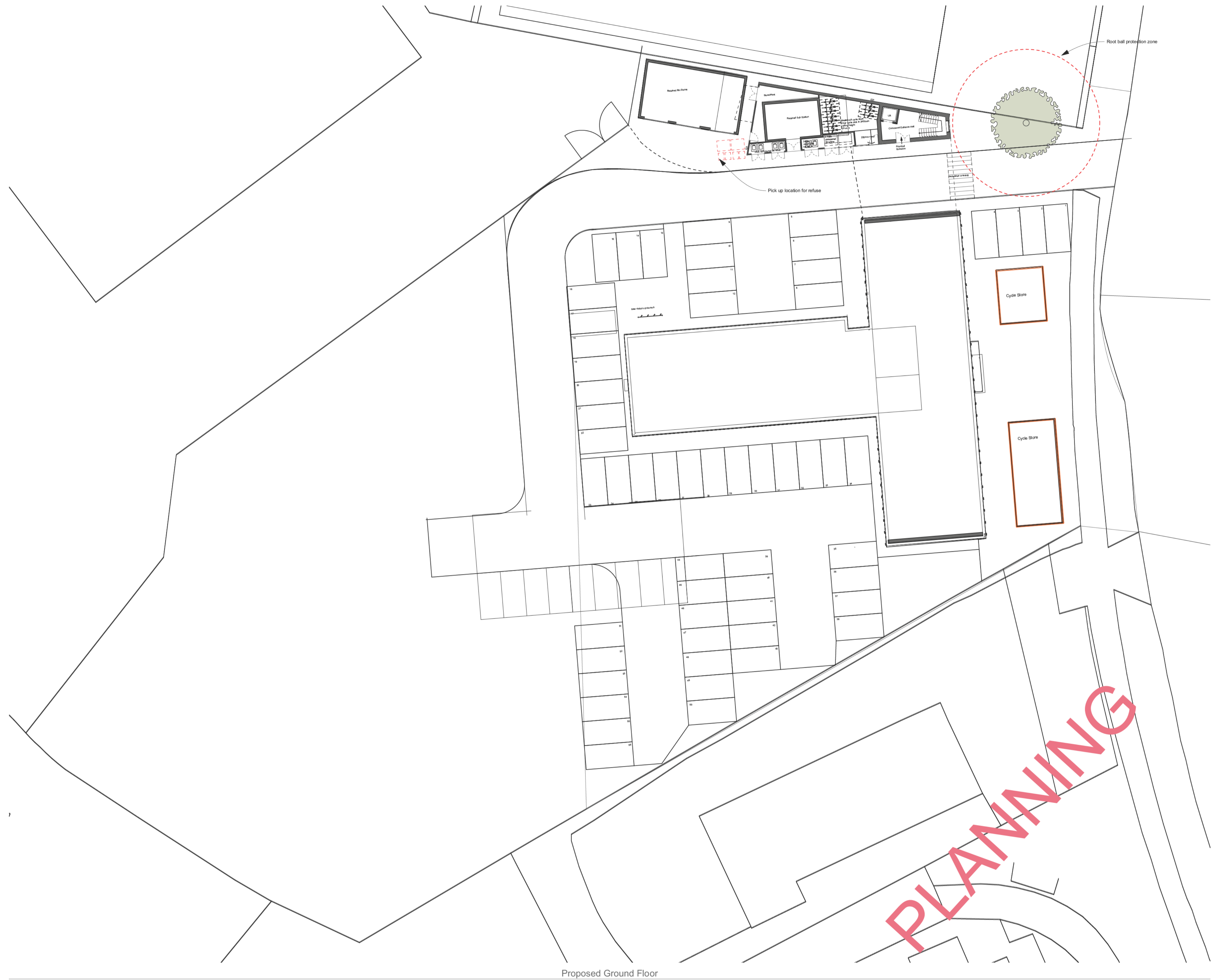
Proposed Ground Floor