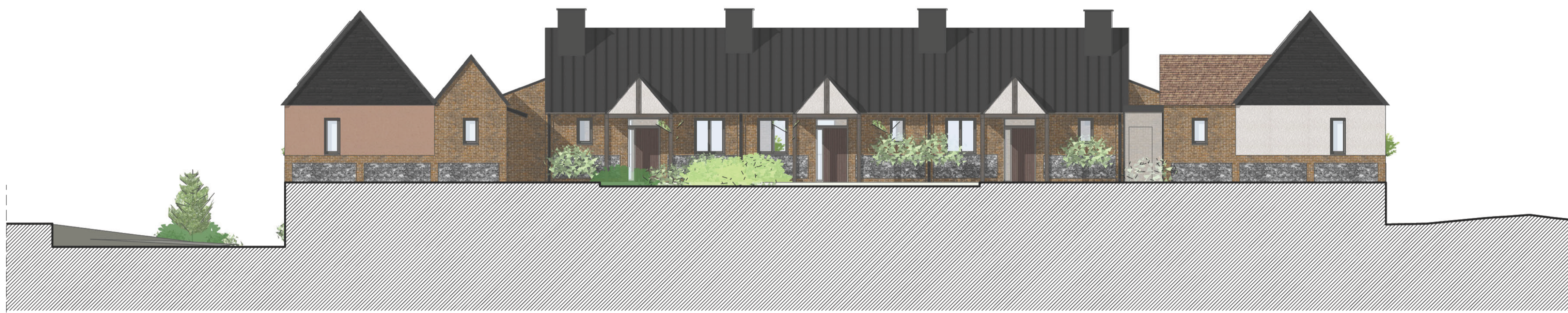
Type 10 - South elevation