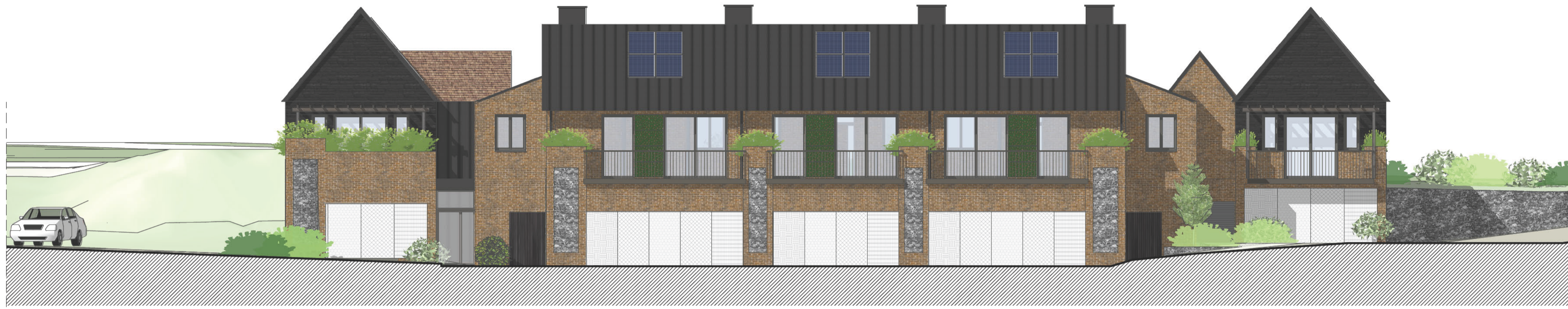
Type 10 - North elevation