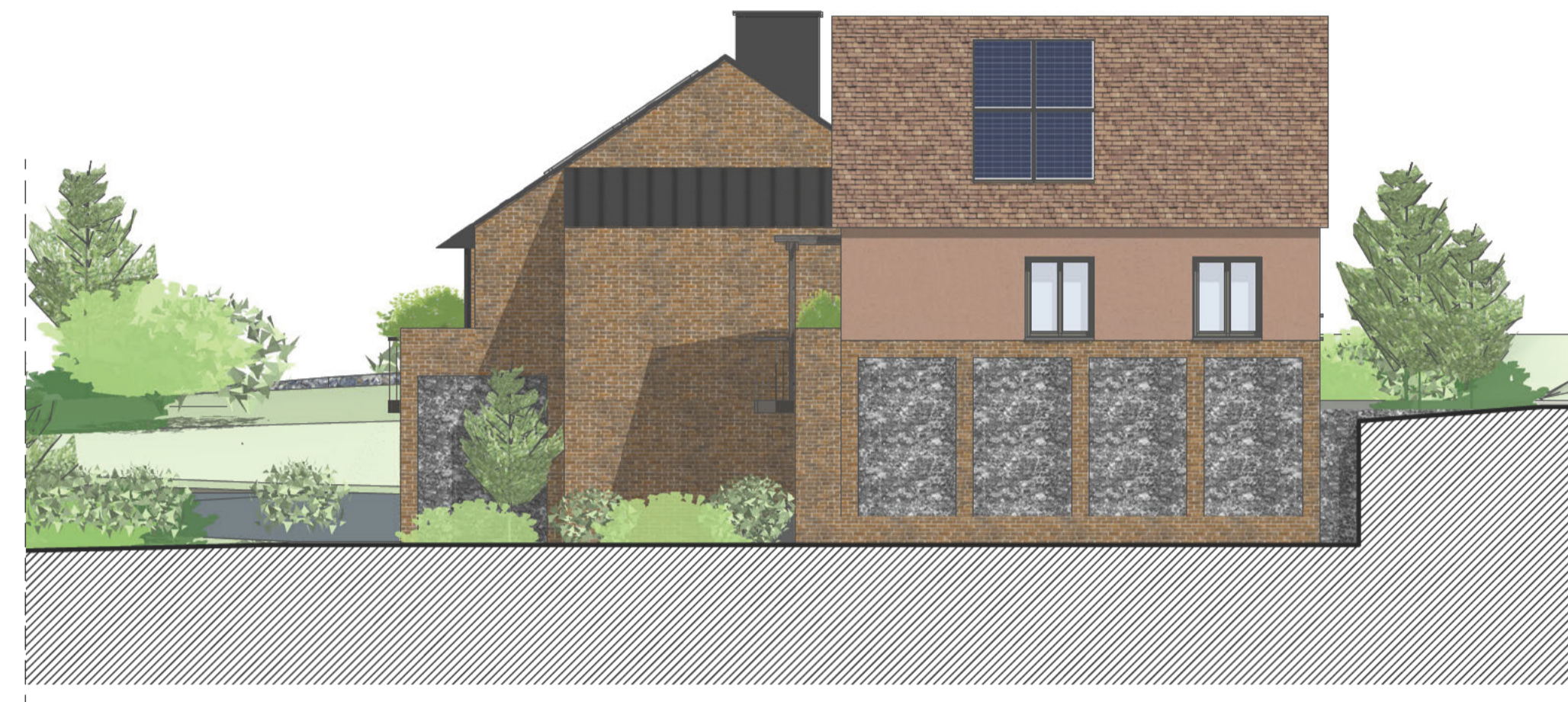
Type 10 - East elevation