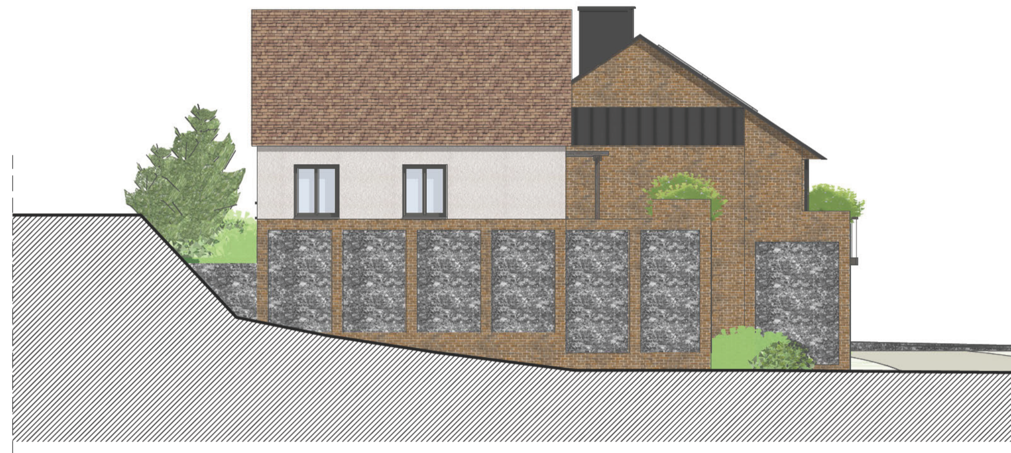
Type 10 - West elevation