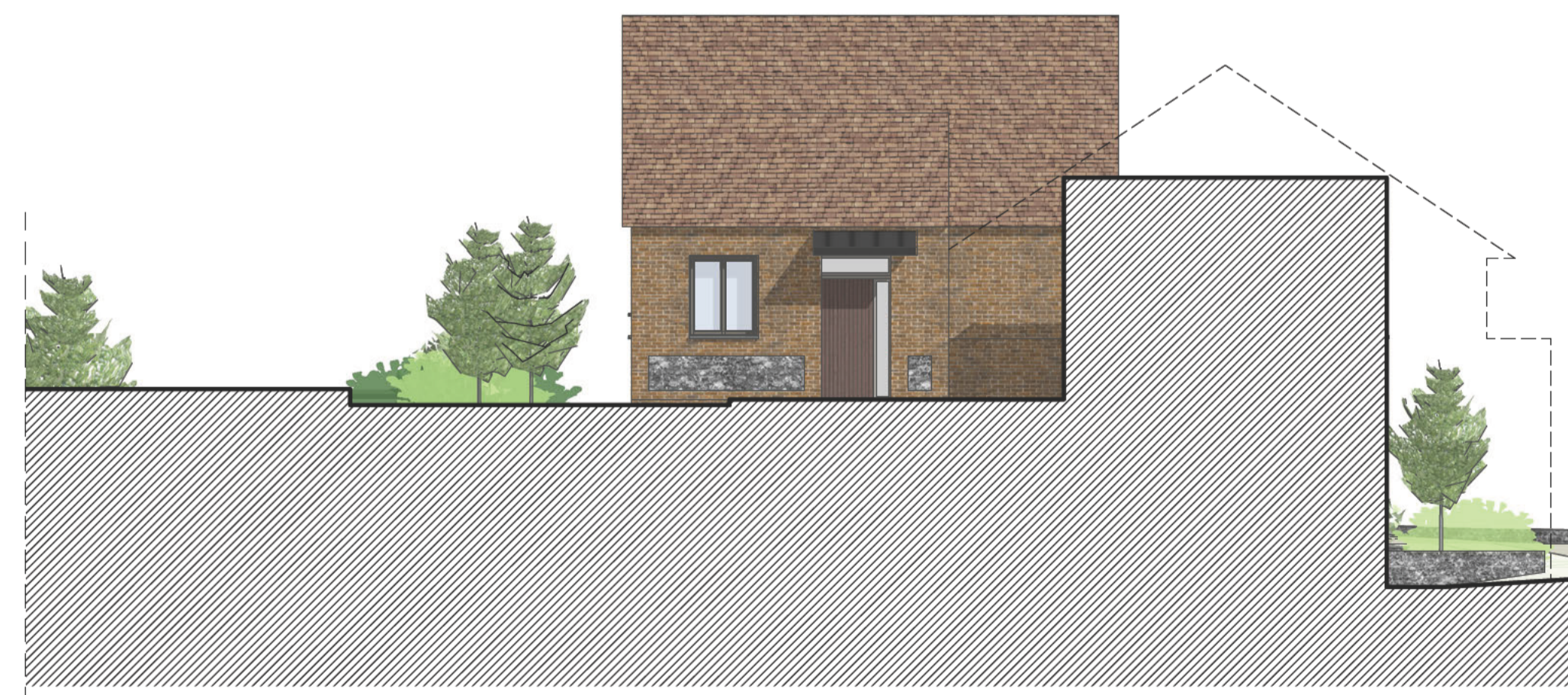
Type 10 - West elevation 2 (internal courtyard)