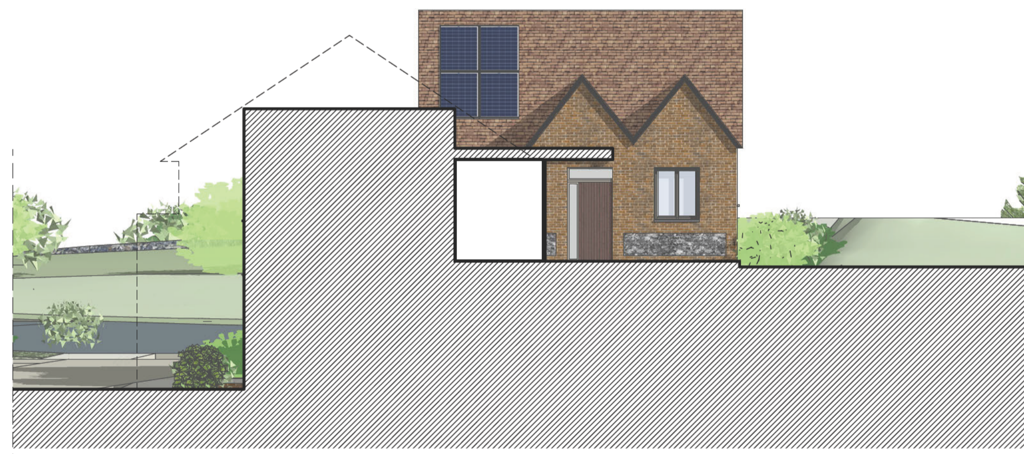
Type 10 - East elevation 2 (internal courtyard)