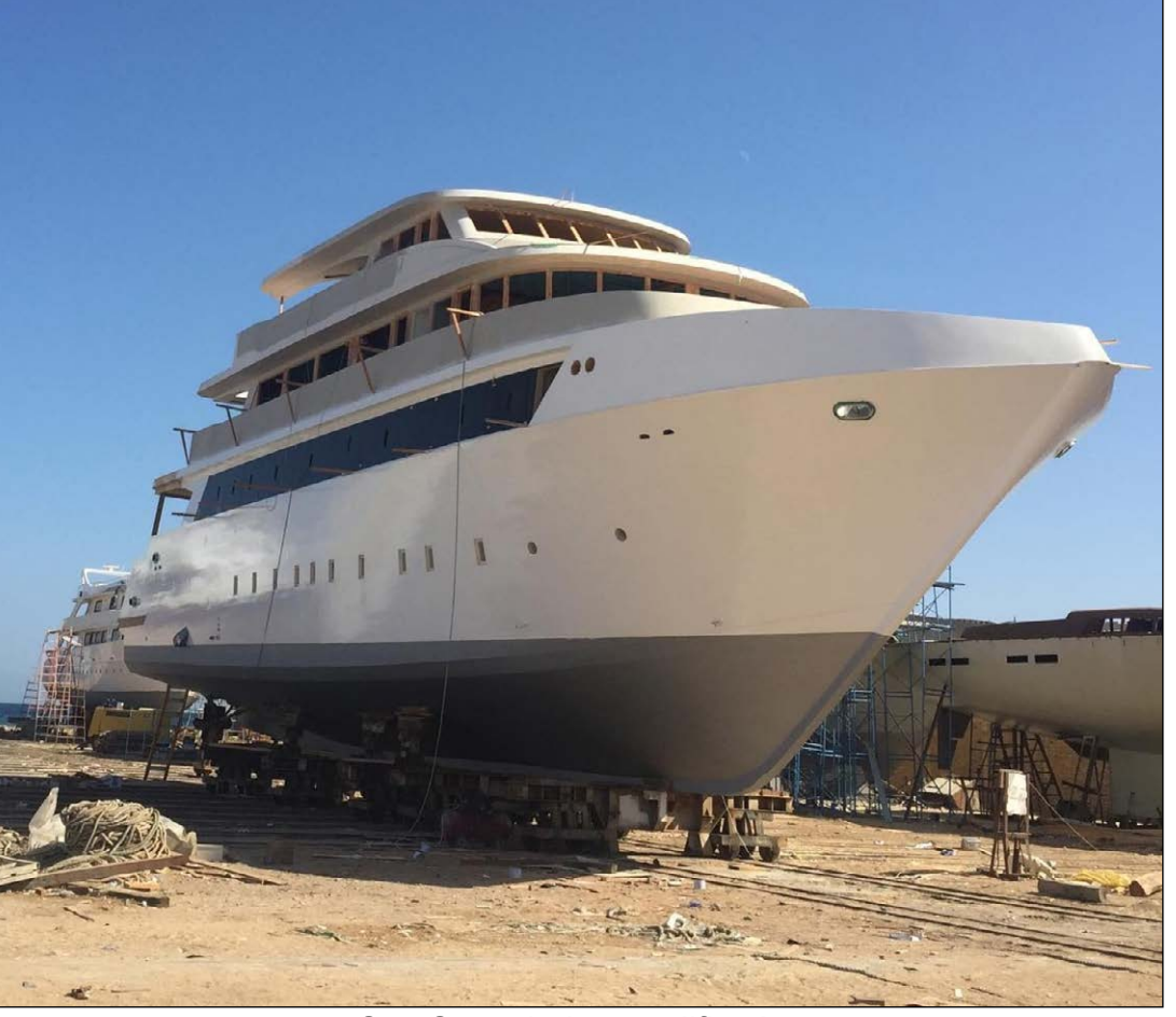
Sea Story during modification