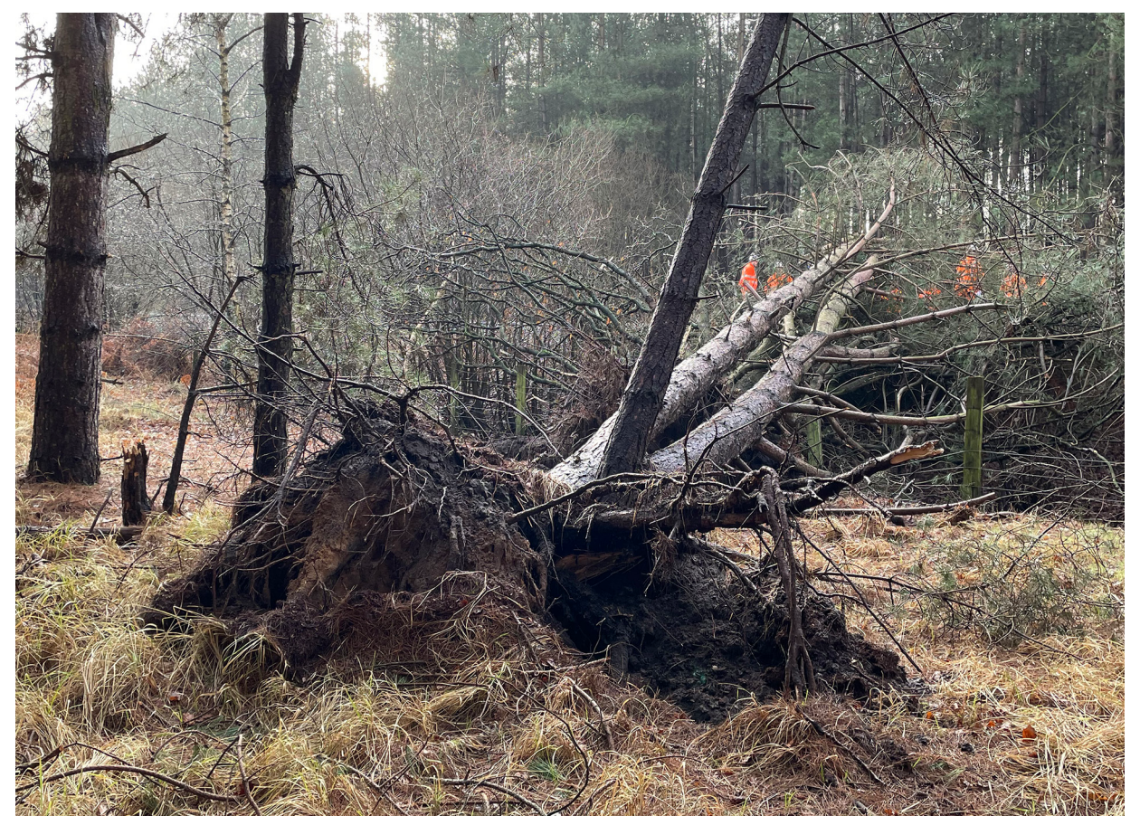
Figure 5: The root structure of the pine tree after the accident, showing the many pulled out transport roots.