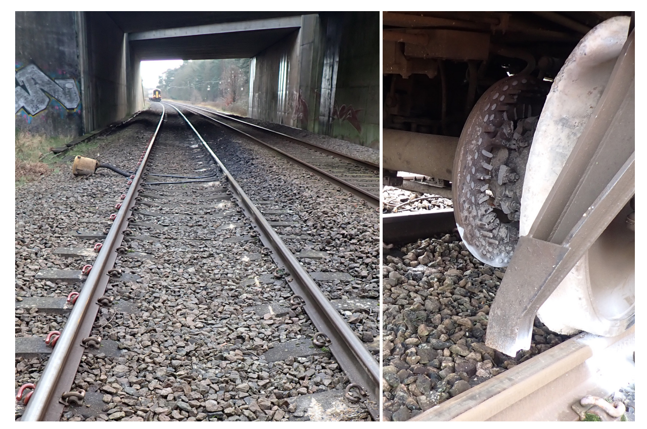
Figure 9: The train's final stopping position beyond the A11 bridge and the sleeper marks made during the derailment (left) and the remains of the axle-mounted brake disc following the train being rerailed (right).