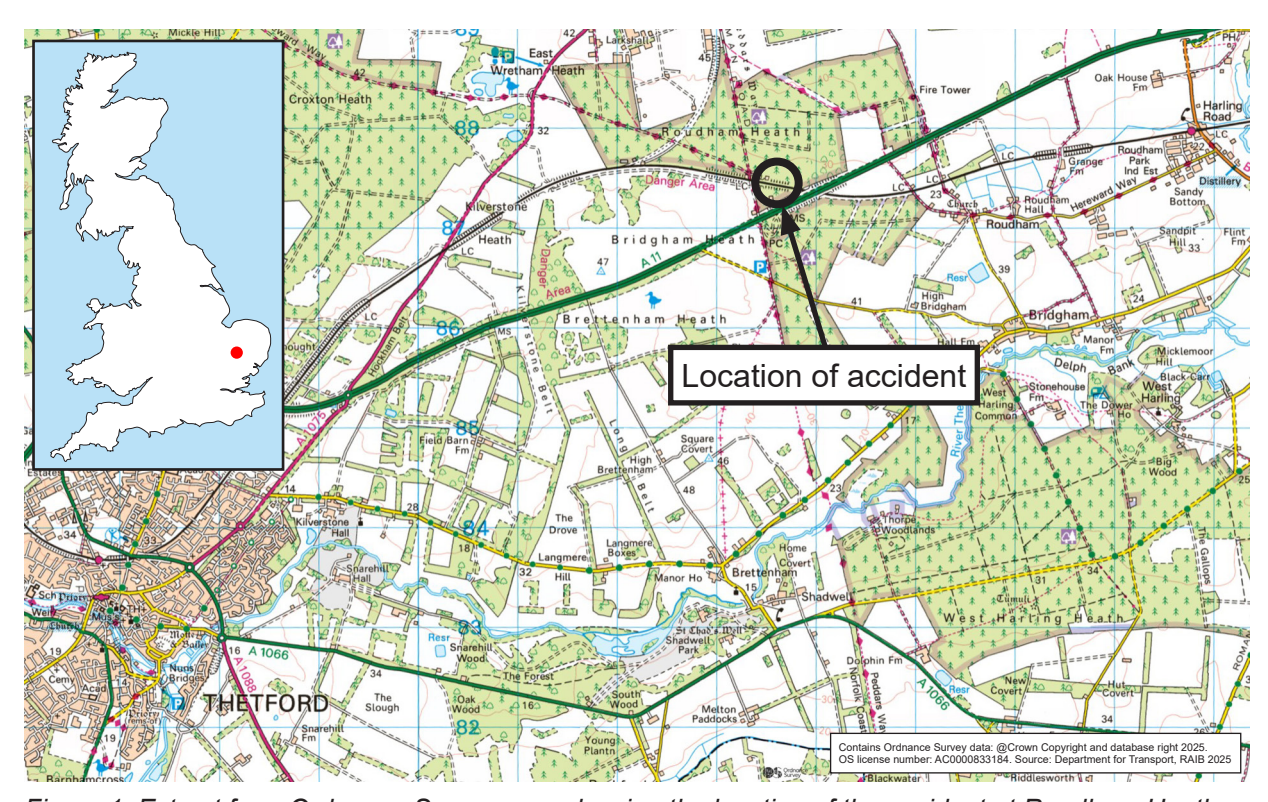
Figure 1: Extract from Ordnance Survey map showing the location of the accident at Roudham Heath.

5 Roudham Heath is an area of mixed woodland in western Norfolk, forming an outlying part of Thetford Forest. The town of Thetford lies around 5 miles (8 km) to the south-west (figure 1). Harling Road station is 2.5 miles (4 km) to the east.