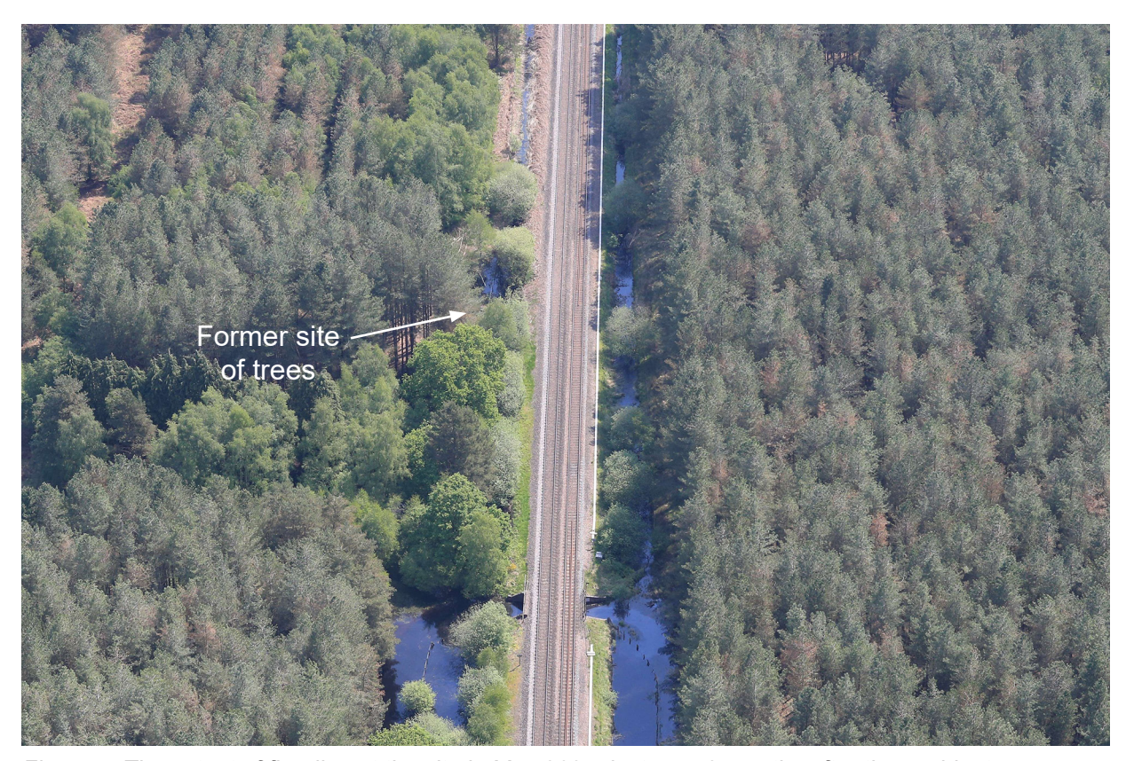
Figure 7: The extent of flooding at the site in May 2024, just over 3 months after the accident. The previous location of the pine and oak trees is indicated.