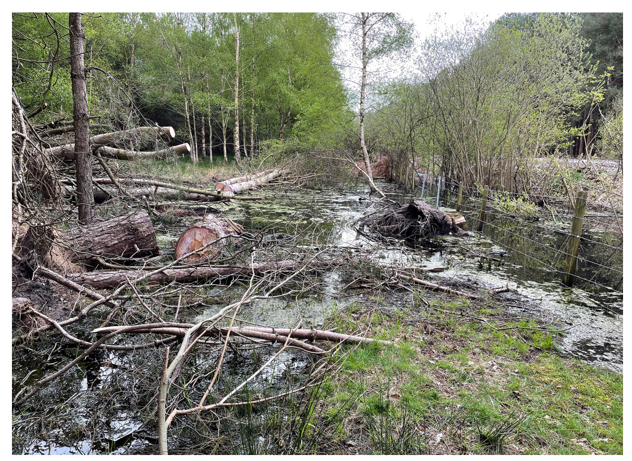
Figure 6: Site conditions during the post-accident inspection in April 2024.