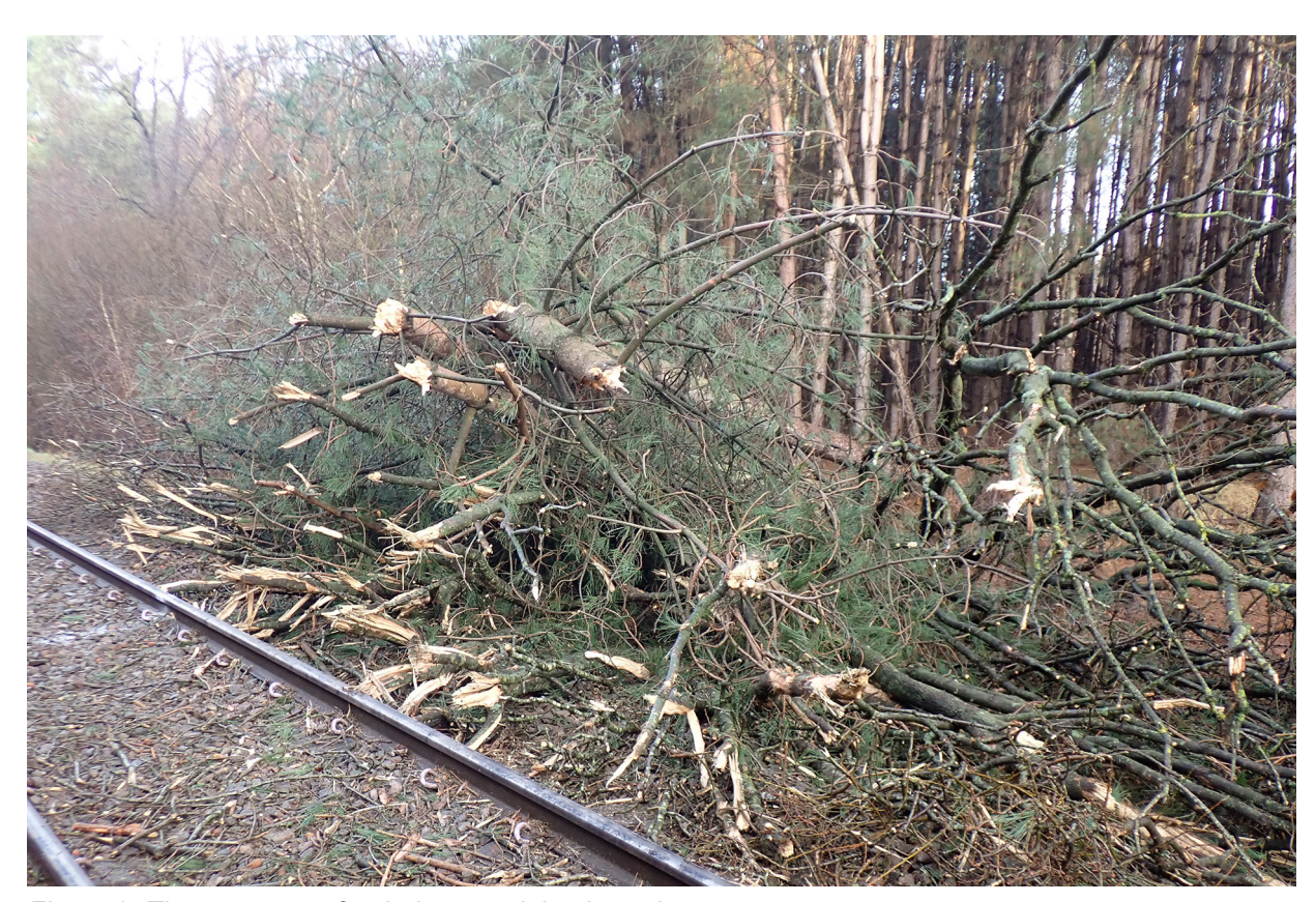
Figure 3: The two trees after being struck by the train.