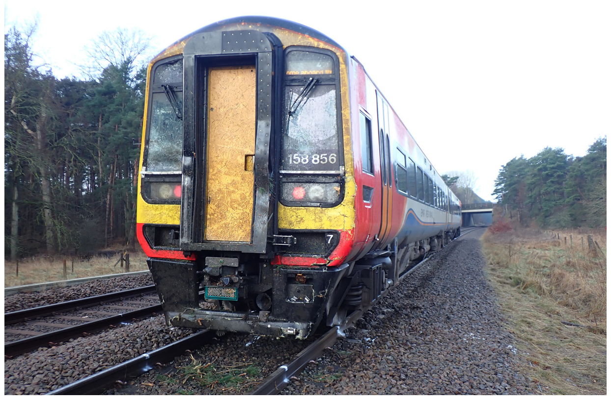
Figure 4: The damage to the front of the train (train shown after being rerailed).