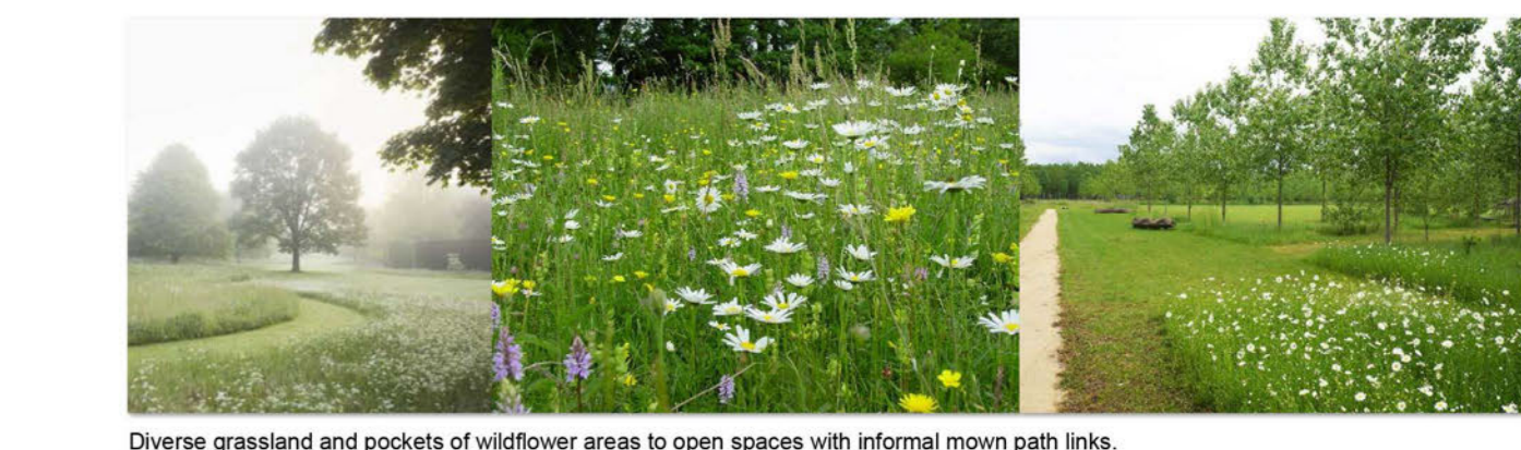
Diverse grassland and pockets of wildflower areas to open spaces with informal moorland paths.