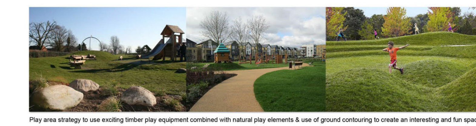
Play area strategy to use exciting timber play equipment combined with natural play elements & use of ground contouring to create an interesting and fun space.