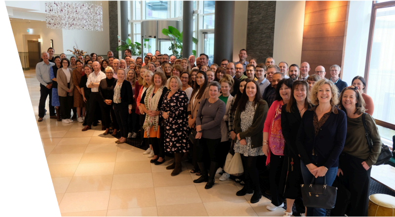
Photo: Members of the DASA team at an All Staff meeting, 2023

Our aim is to continue to ensure a safe, secure and inclusive workplace in which everyone can achieve their full potential. Creating a culture of diversity and inclusion makes sense for any organisation but for us, as we aim to find and fund innovation, it is essential. We need to reach out and find the best innovations wherever they are located and that requires us to be diverse and inclusive in our approach inside, as well as outside, the team. A diverse and inclusive environment leads to creativity and drives innovation, and this in turn ensures we are achieving the best results and improving our reputation for spot on delivery. We will take positive action and take nothing for granted in our quest to recruit and retain the best talent and create an inclusive team that is inspired to do even better things.