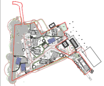
KEYPLAN Dwelling Type C