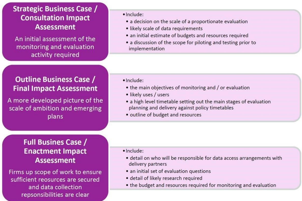
Figure 1.2: Evaluation planning expected at each appraisal stage.

Source: Figure 1.2: Evaluation planning expected at each appraisal stage. The Magenta Book , HM Treasury guidance on evaluation