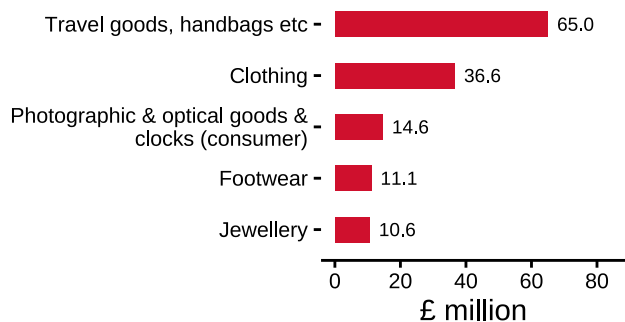
The top 5 UK goods exports, in the four quarters to the end of Q2 2024, to Macao SAR

The chart below shows the top 5 products exported from the UK to Macao SAR and the top 5 products imported to the UK from Macao SAR, by value, in the four quarters to the end of Q2 2024. All data shown in the chart are provided in the text above.