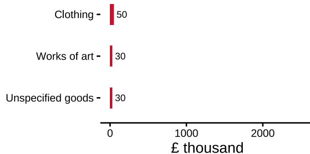
The top 3 UK goods imports, in the four quarters to the end of Q2 2024, from Bhutan