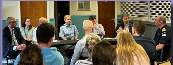
SFA roadshow session at Portsmouth