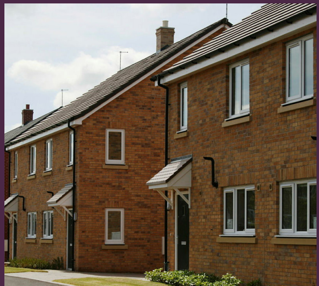
Service Family Accommodation at Beacon Barracks

Full details of the announcement can be found here . We appreciate you may have questions and we will update you in due course with further information.