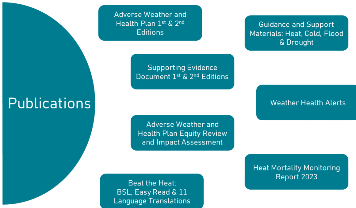
Figure 1. Publications