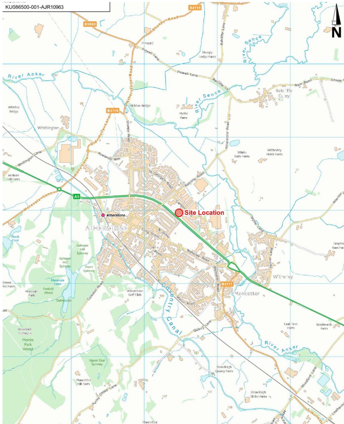
Figure 1: Site Location.