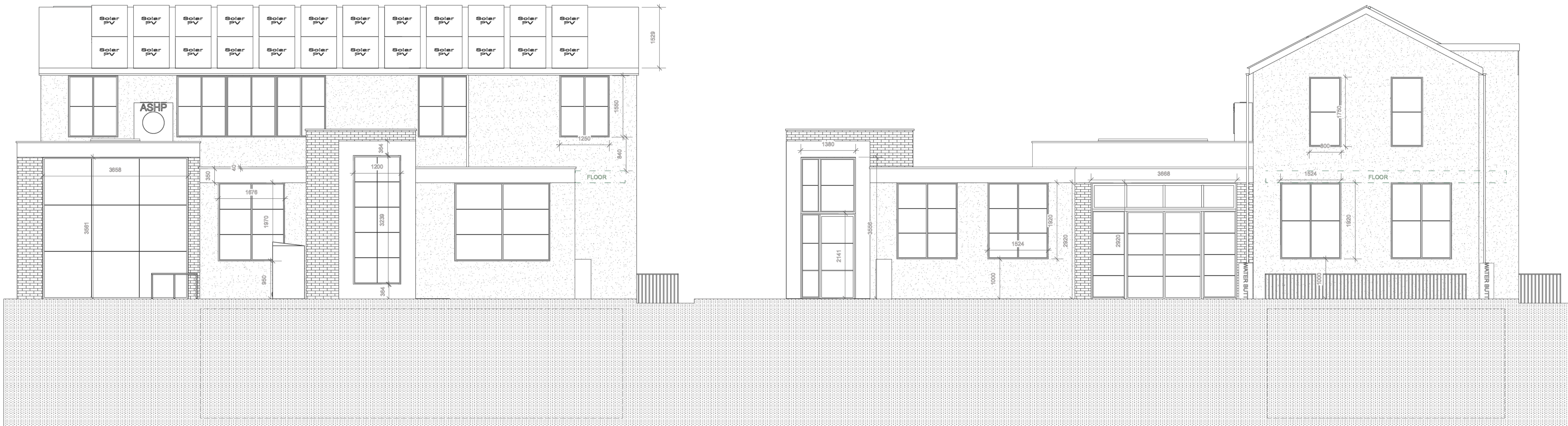
3 Proposed South West Elevation Scale: 1:50