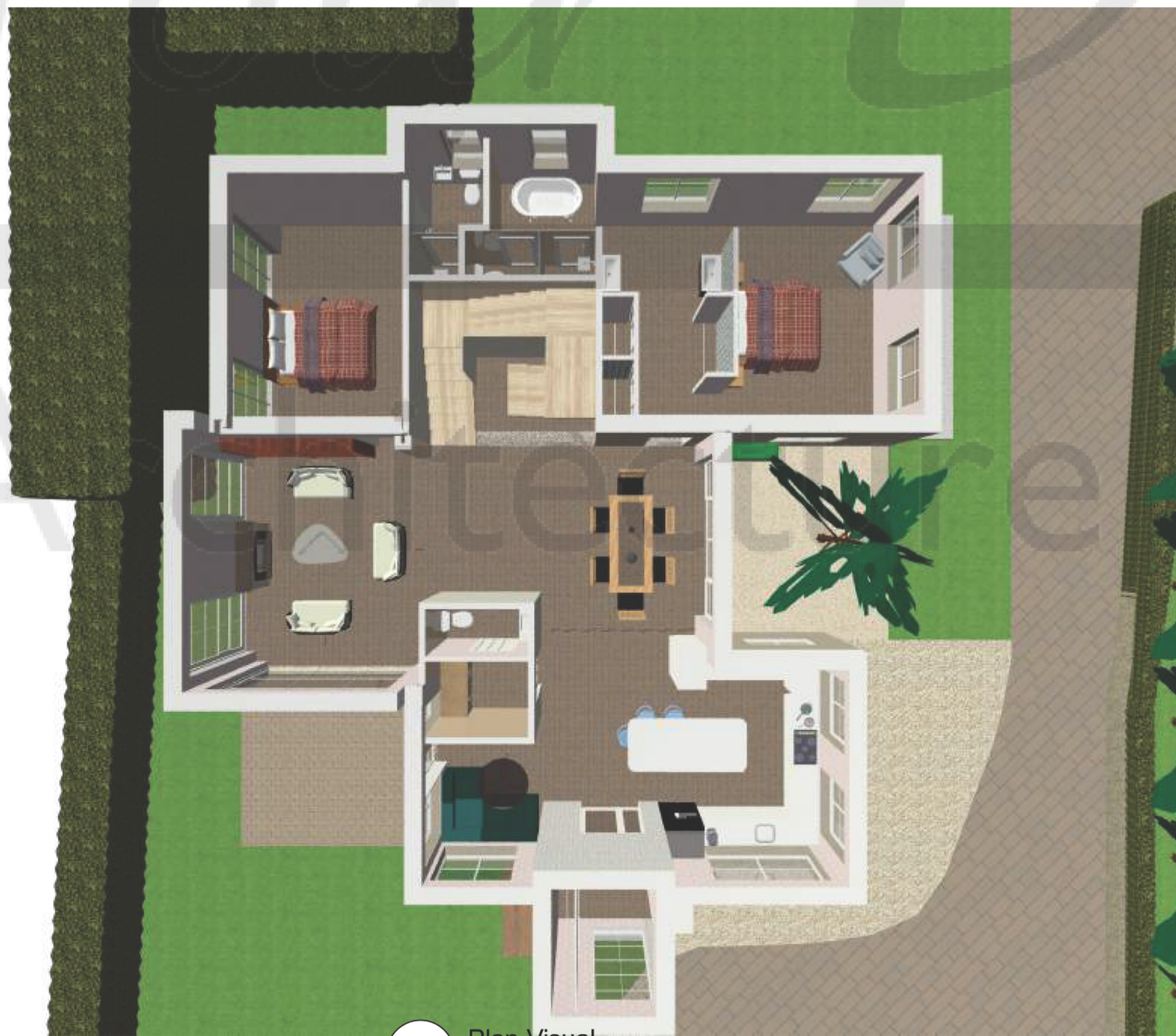
6 Plan Visual Scale: NONE