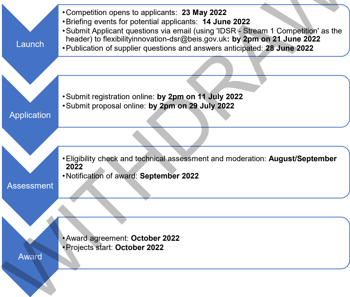
Figure 3.1: Competition Timetable

Successful projects are expected to run from October 2022 to October 2024. Indicative key dates applicable to the Competition are shown in Figure 3.1. Please note BEIS reserves the right to vary these dates.