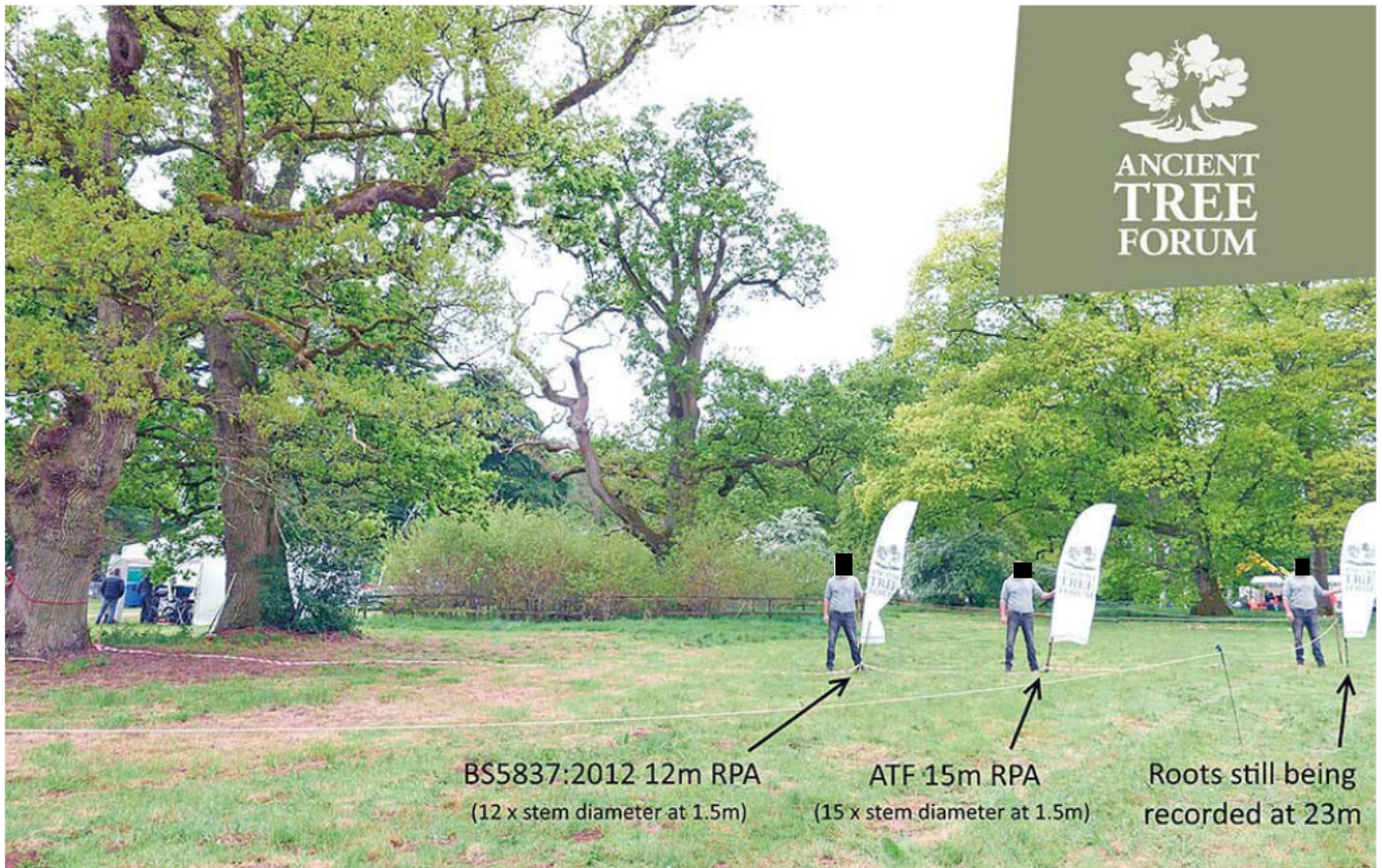
Picture 1: Composite photograph illustrating the radius of the different root protection areas alongside the known minimum root spread.

A common conflict between development and veteran trees centres on the protection of the rooting environment.