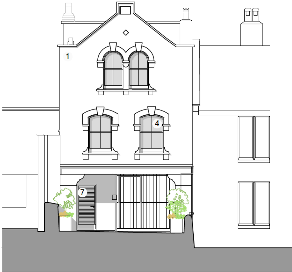
Proposed Coach House North East Elevation Scale 1:100

Responsibility is not accepted for errors made by others scaling from this drawing. All construction information should be taken from figured dimensions only.