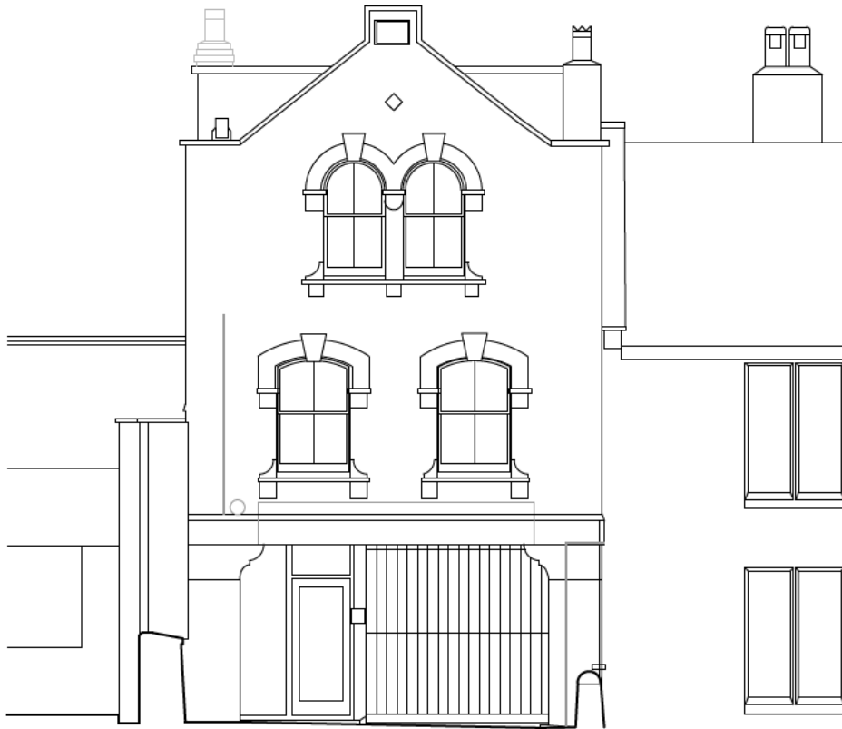
Existing Coach House North East Elevation Scale 1:100

Responsibility is not accepted for errors made by others scaling from this drawing. All construction information should be taken from figured dimensions only.