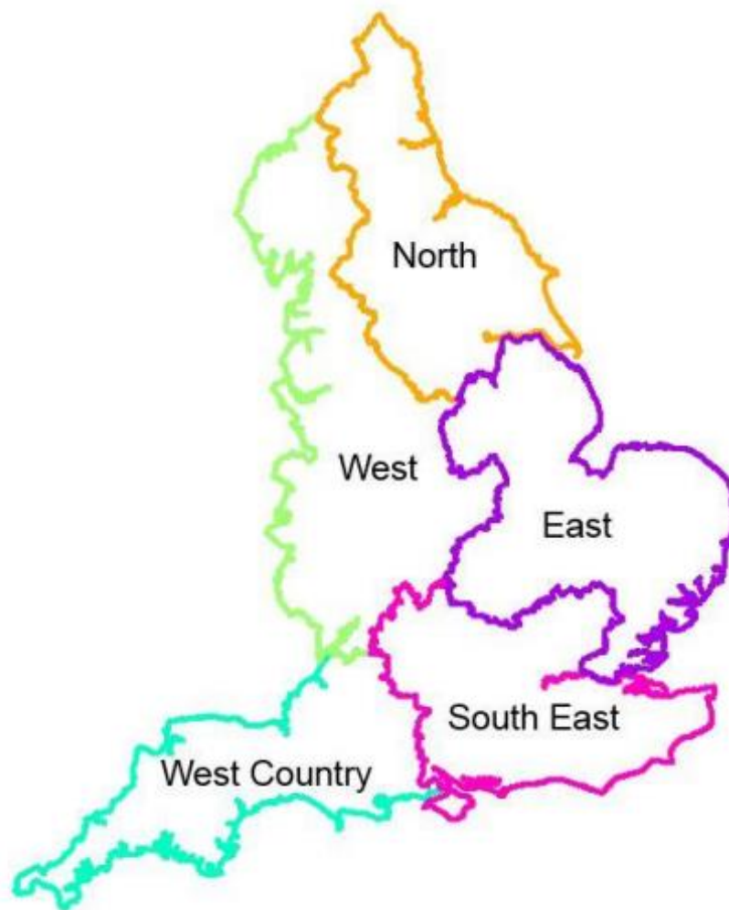
Figure 2 Five regional water resources groups (from Environment Agency 2020)

Five regional water resource plans are being developed to provide more strategic solutions to future water supply and environmental protection across England, with final plans due to be published in 2023 (see Figure 2 for regional groups). The requirements for these regional plans were agreed through a collaborative process as part of the National Framework (Environment Agency, 2020). Water companies, large water users, local authorities, regulators, environmental groups, and others within each region are working together to ensure sustainable and resilient water resources into the future. These plans draw on the WRMPs to estimate future public water supply (PWS), but also consider non-PWS users, including agriculture, industry, and the environment. Adjustments have been made to PWS forecasts to reflect the changes in demand caused by COVID-19 (observed increases in PCC through 2021), which are likely to extend into the future as working patterns change.