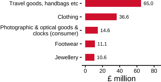
The top 5 UK goods exports, in the four quarters to the end of Q2 2024, to Macao SAR

The chart below shows the top 5 products exported from the UK to Macao SAR and the top 5 products imported to the UK from Macao SAR, by value, in the four quarters to the end of Q2 2024. All data shown in the chart are provided in the text above.