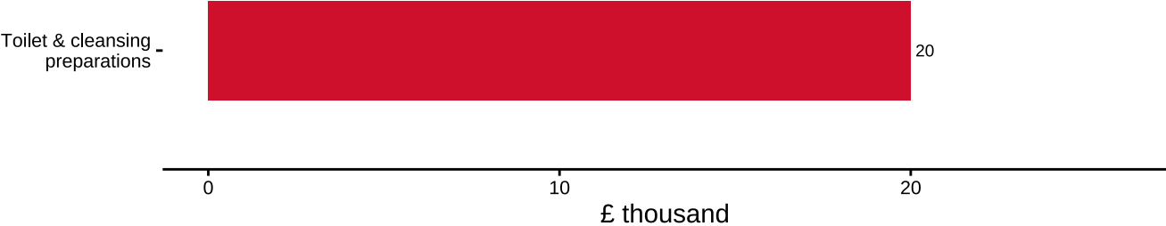
The top 1 UK goods exports, in the four quarters to the end of Q2 2024, to Palau

The chart below shows the top product exported from the UK to Palau, by value, in the four quarters to the end of Q2 2024. All data shown in the chart are provided in the text above.