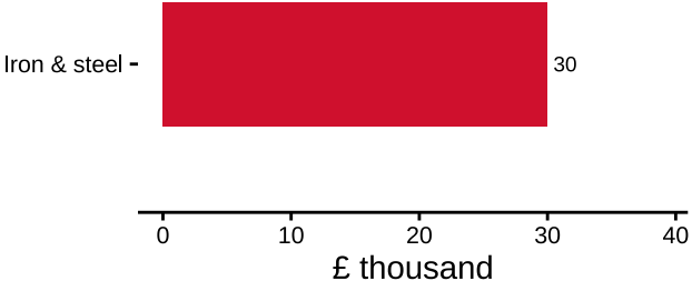
The top 1 UK goods imports, in the four quarters to the end of Q2 2024, from BIOT