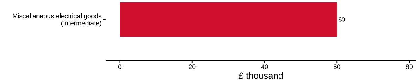
The top 1 UK goods exports, in the four quarters to the end of Q2 2024, to Tuvalu

The chart below shows the top product exported from the UK to Tuvalu, by value, in the four quarters to the end of Q2 2024. All data shown in the chart are provided in the text above.