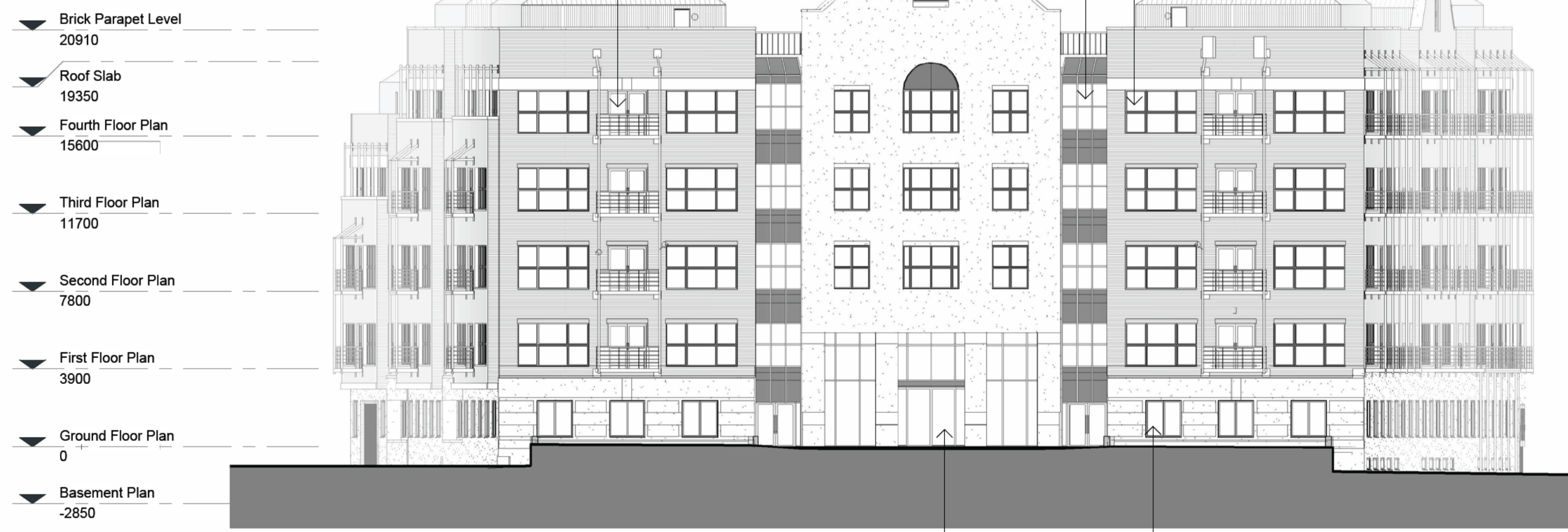
6 Proposed Building - Elevation 6 - Planning. 1 : 200

Proposed aluminium frame double glazed windows, to match existing window design and profiles. All proposed windows to have fixed frames. Colour to be dark grey.