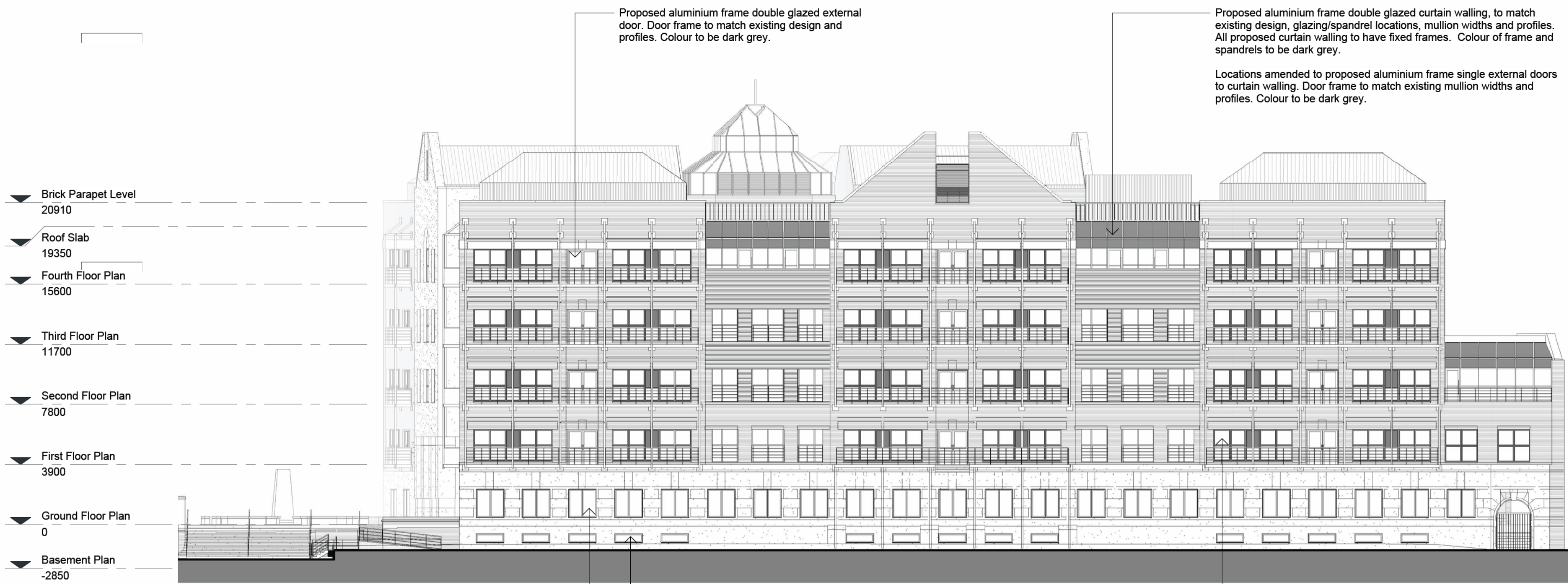
5 Proposed Building - Elevation 5 - Planning. 1 : 200

Proposed aluminium frame double glazed external door. Door frame to match existing design and profiles. Colour to be dark grey.