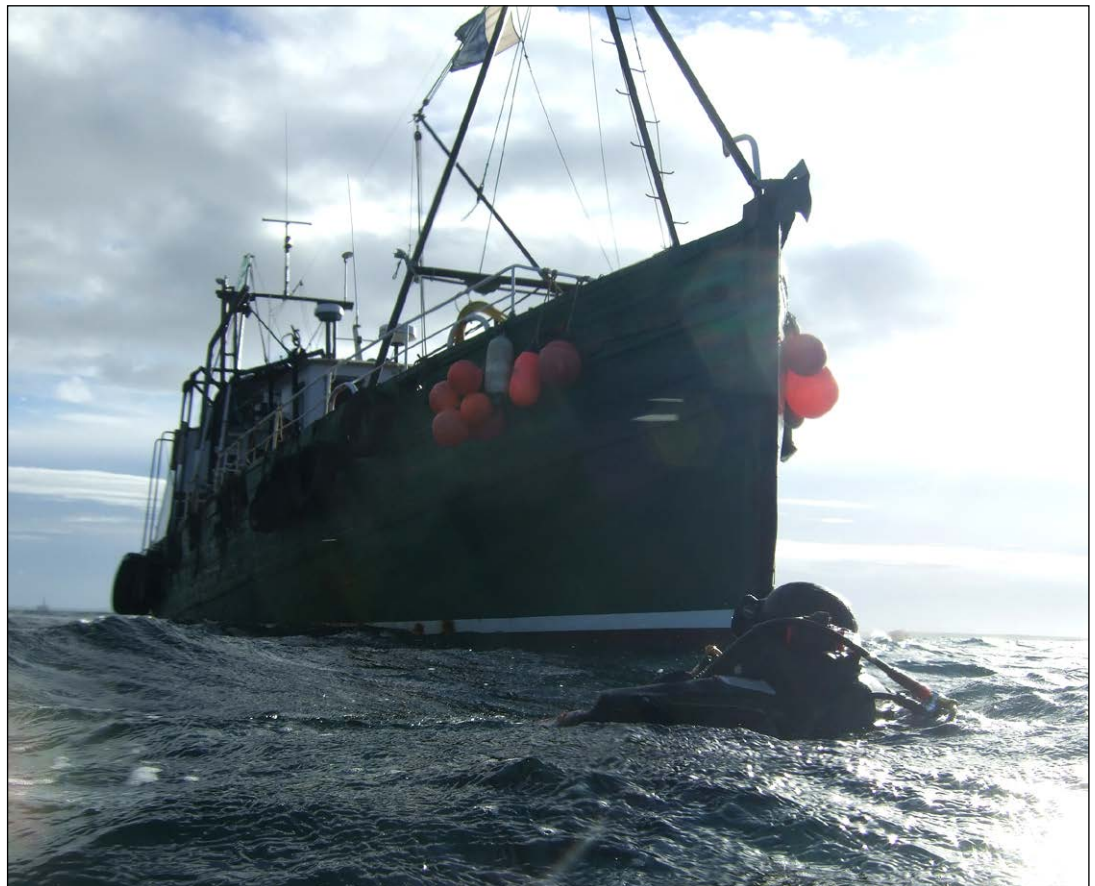
Representative image of a diver surfacing near a dive boat