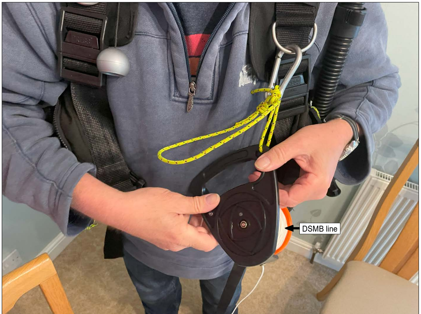
Figure 2: DSMB line attached to harness

Karin was a 24m converted fishing boat with a draught of 2.8m, certified by Mecal Ltd under the Maritime and Coastguard Agency's (MCA) Small Commercial Vessel and Pilot Boat Code of Practice (SCV2), annexed to Marine Guidance Note (MGN) 280 (M). The two crew of Karin comprised a skipper, who was suitably qualified and had extensive experience both as a diver and dive boat skipper engaged in this type of operation, and a crew member whose principal role was that of cook.