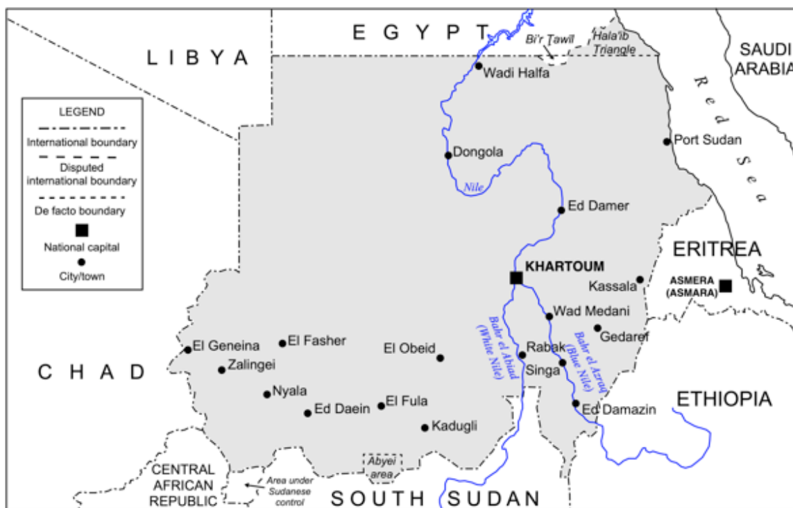
Map of Sudan

Note: this map is for illustrative purposes. It is not to be taken as necessarily representing the view of the UK Government on boundaries or political status.